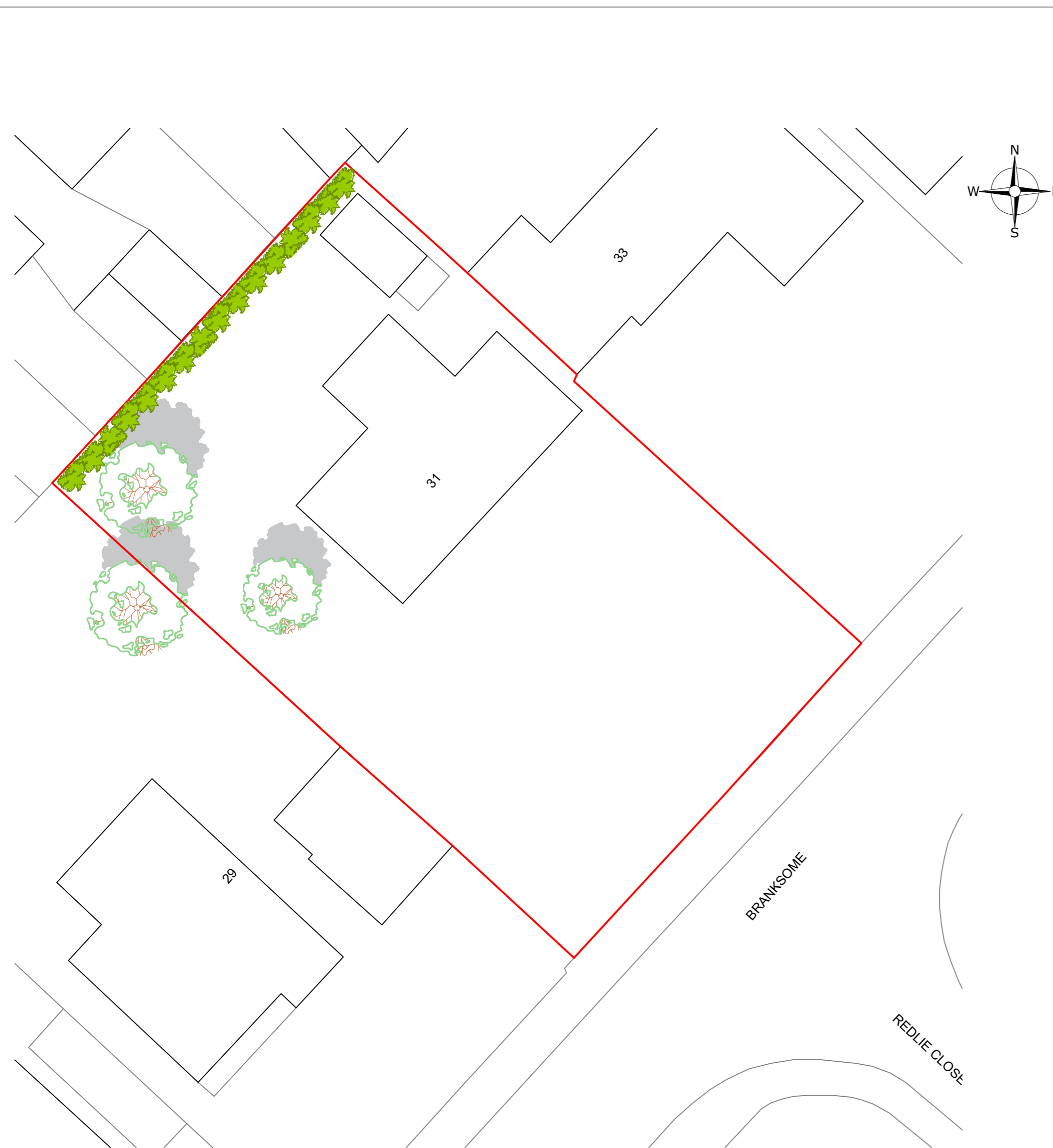
EXISTING SITE PLAN SCALE 1:200 0 1 2 3 4 5m

NOTES: Do not scale this drawing. Work to figured dimensions only. Check all dimensions on site. Confirm any discrepancies prior to commencement of work.