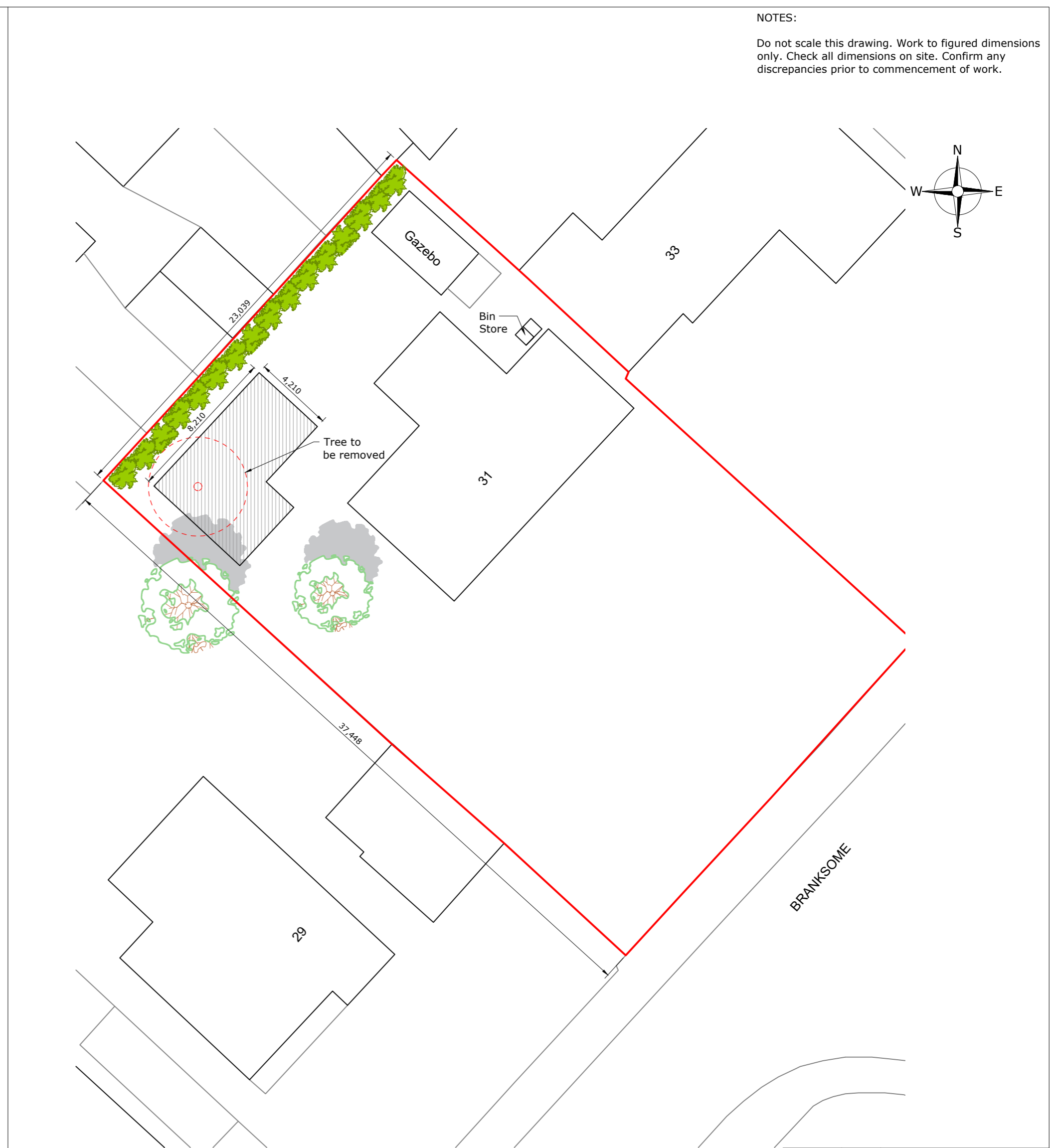
PROPOSED SITE PLAN SCALE 1:200 0 1 2 3 4 5m