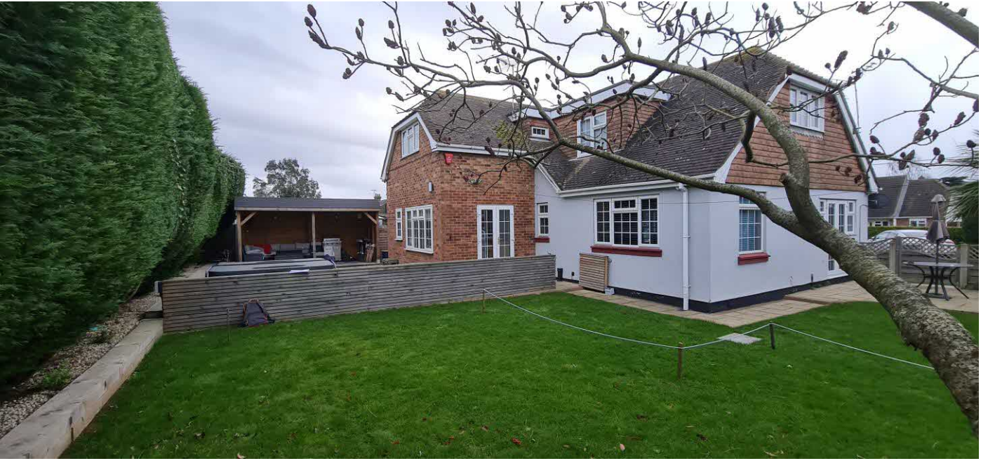
Image showing side & rear elevations and garden.