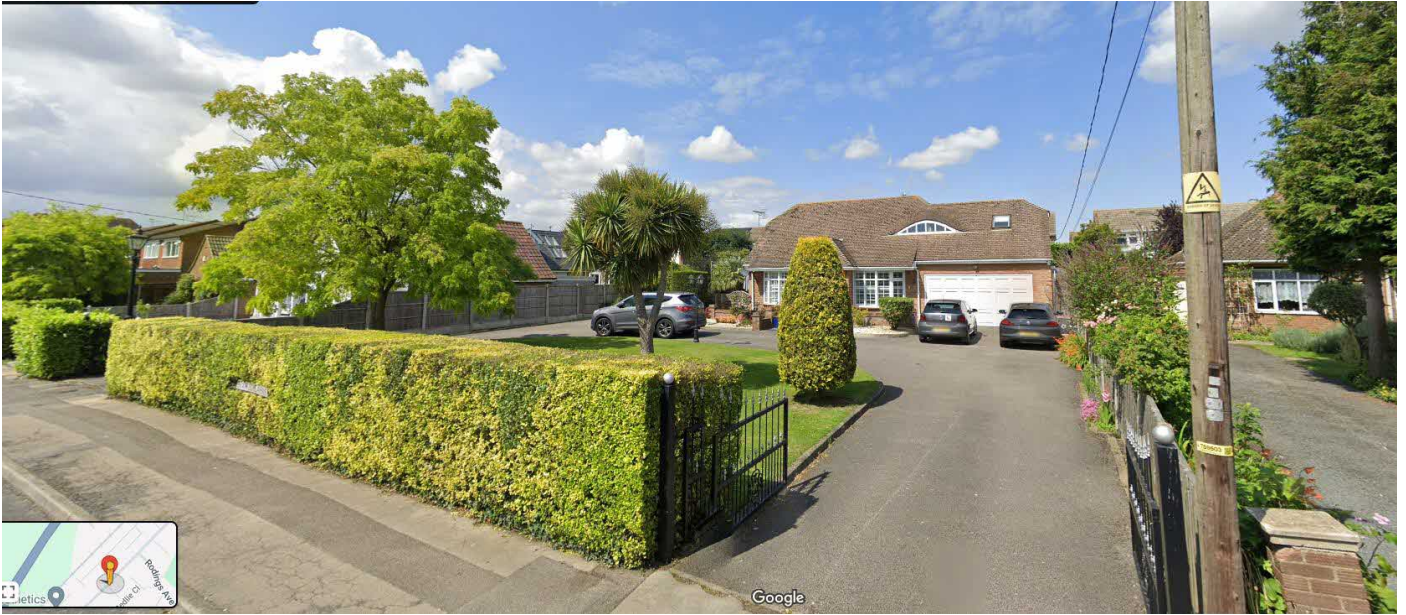
Street view of site taken from google maps