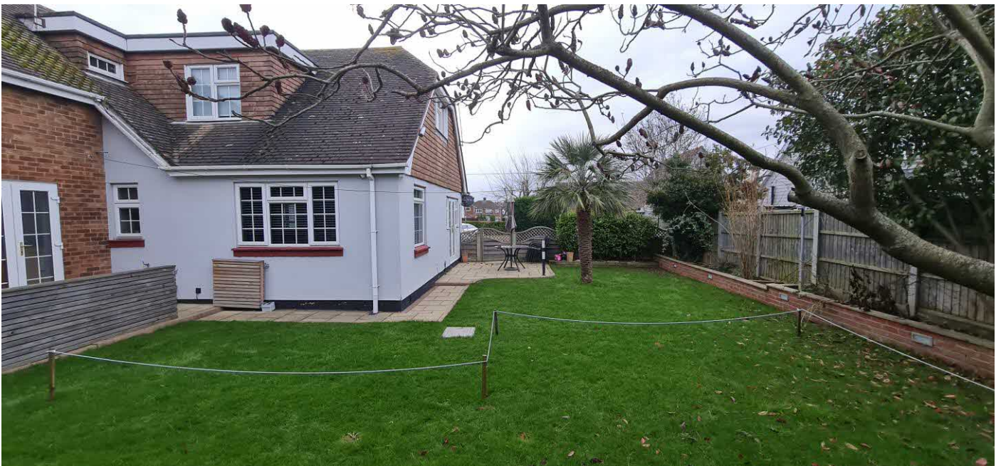
Image showing left elevation.