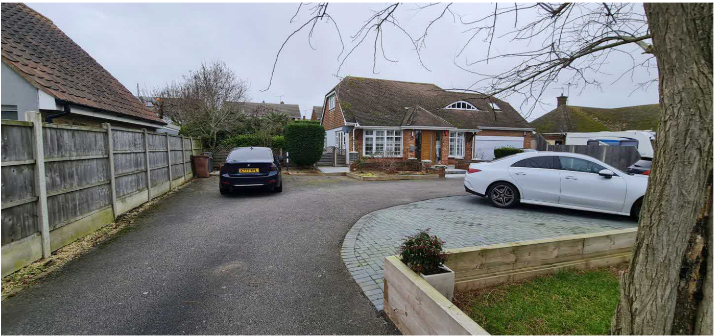
Image showing front elevation and large front garden.