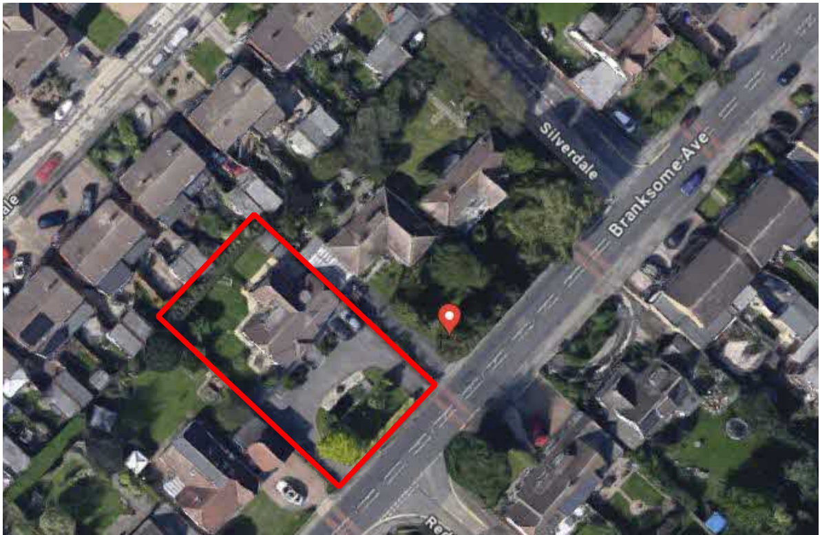
Aerial view of site taken from google maps.