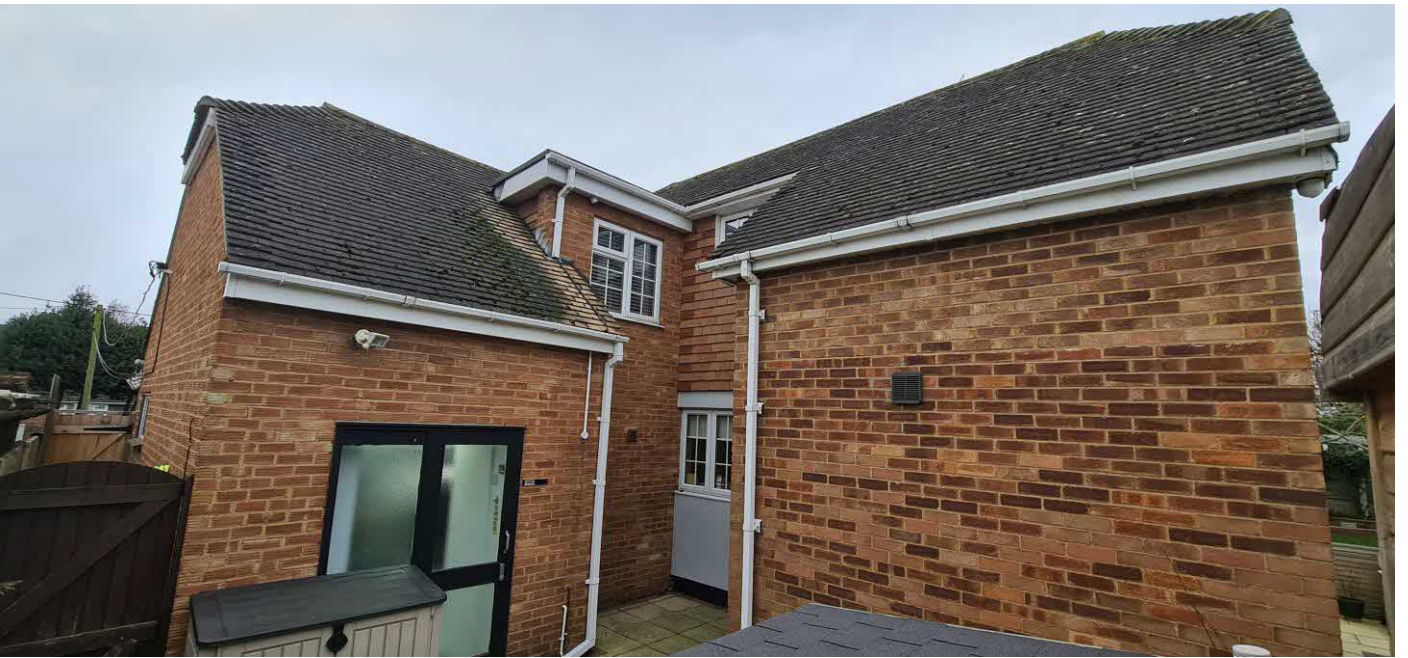
Image showing right elevation.