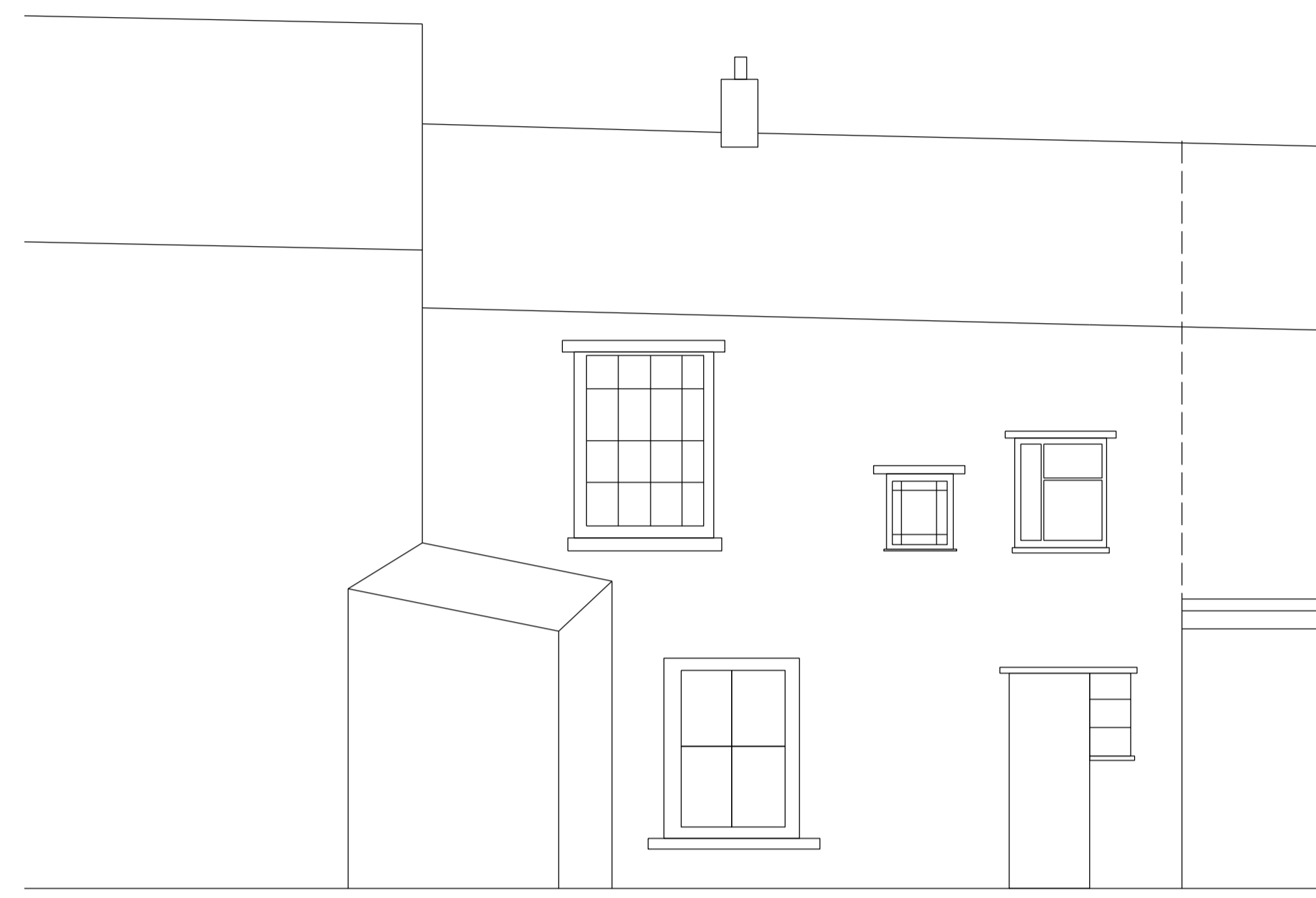
REAR ELEVATION SCALE 1:50