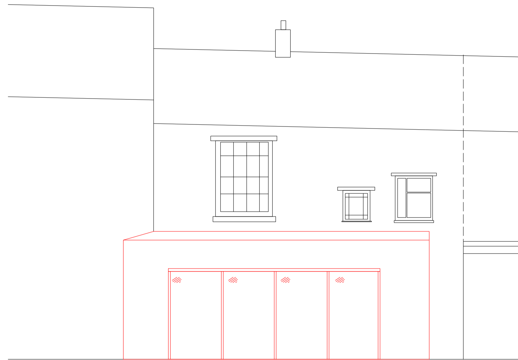
REAR ELEVATION SCALE 1:50