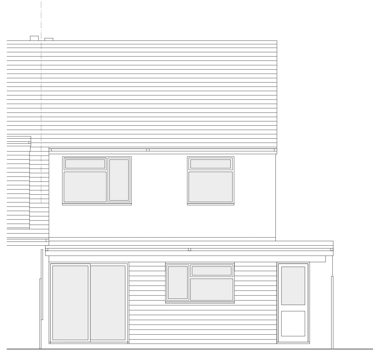
Existing Rear Elevation scale 1:50 @ A2