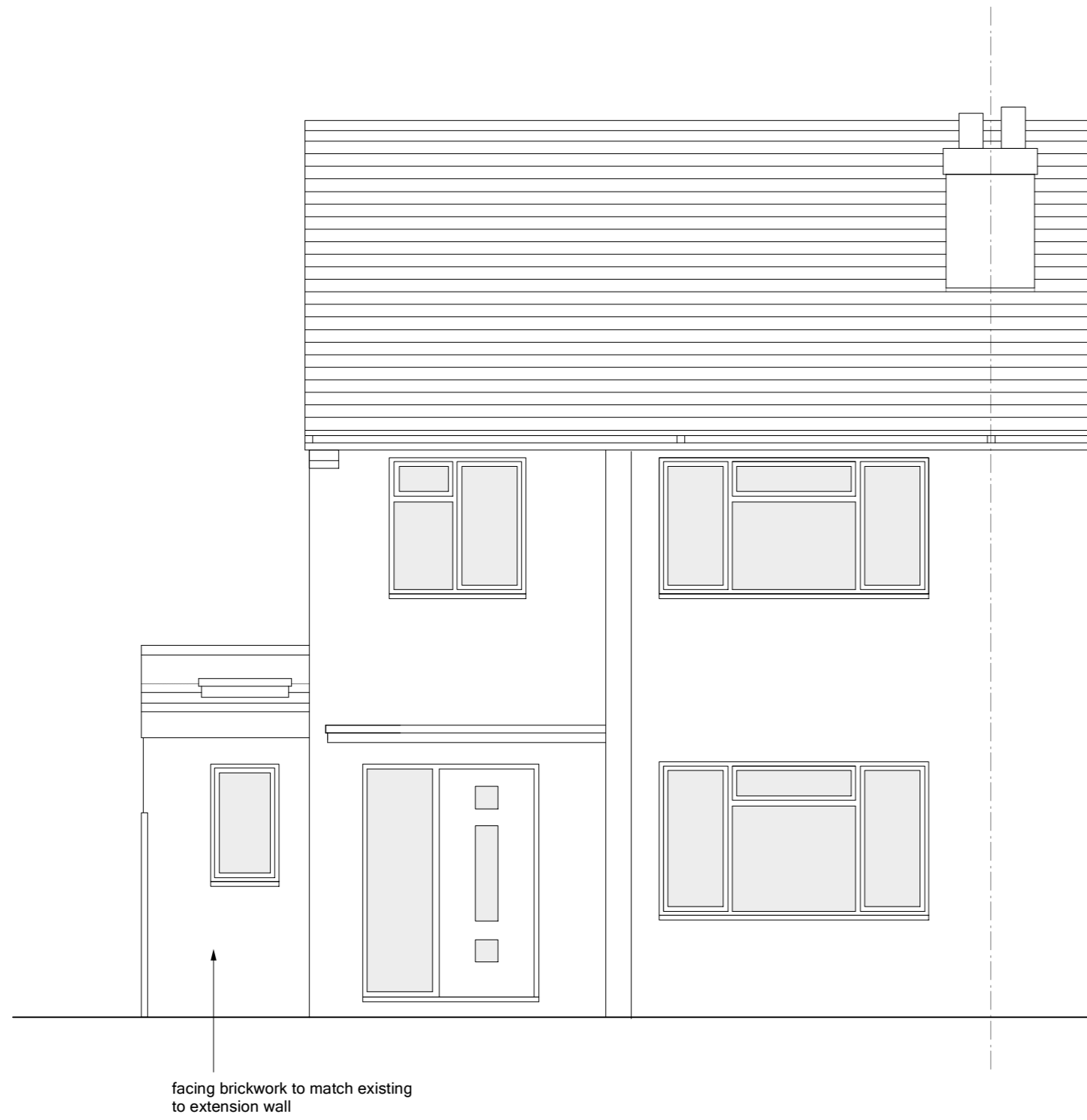
Proposed Front Elevation scale 1:50 @ A2