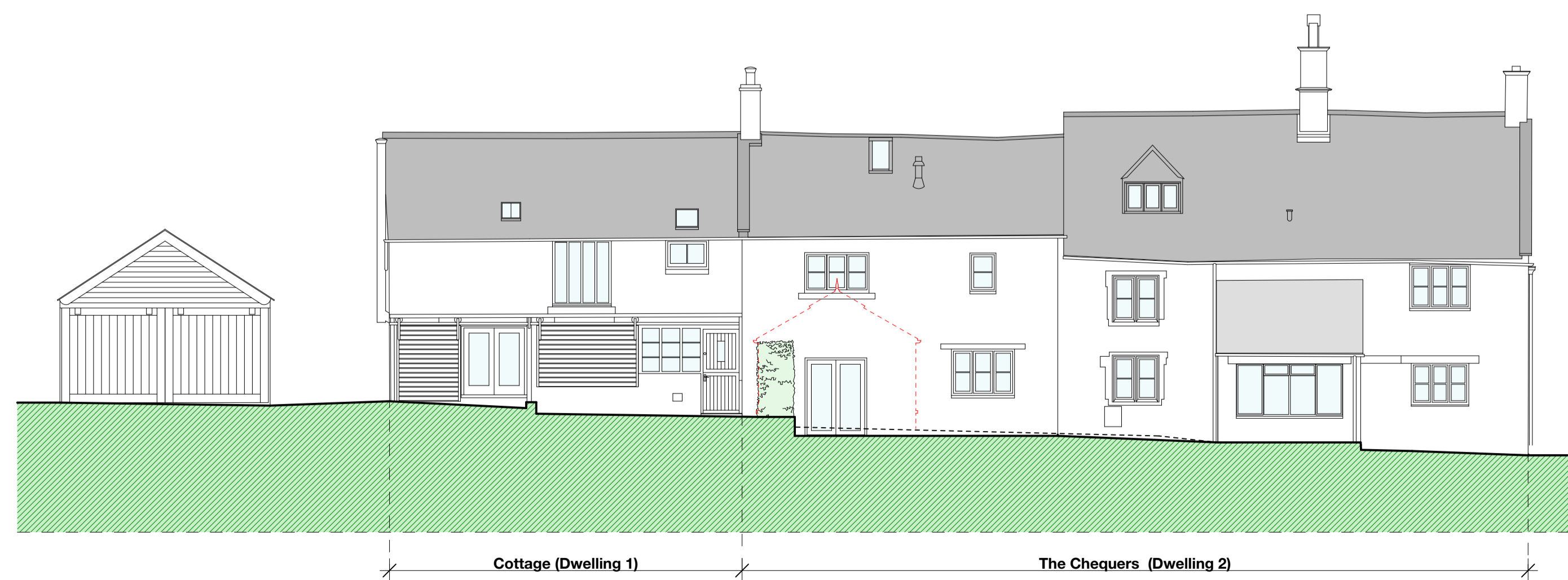
SOUTH EAST ELEVATION (FRONT)