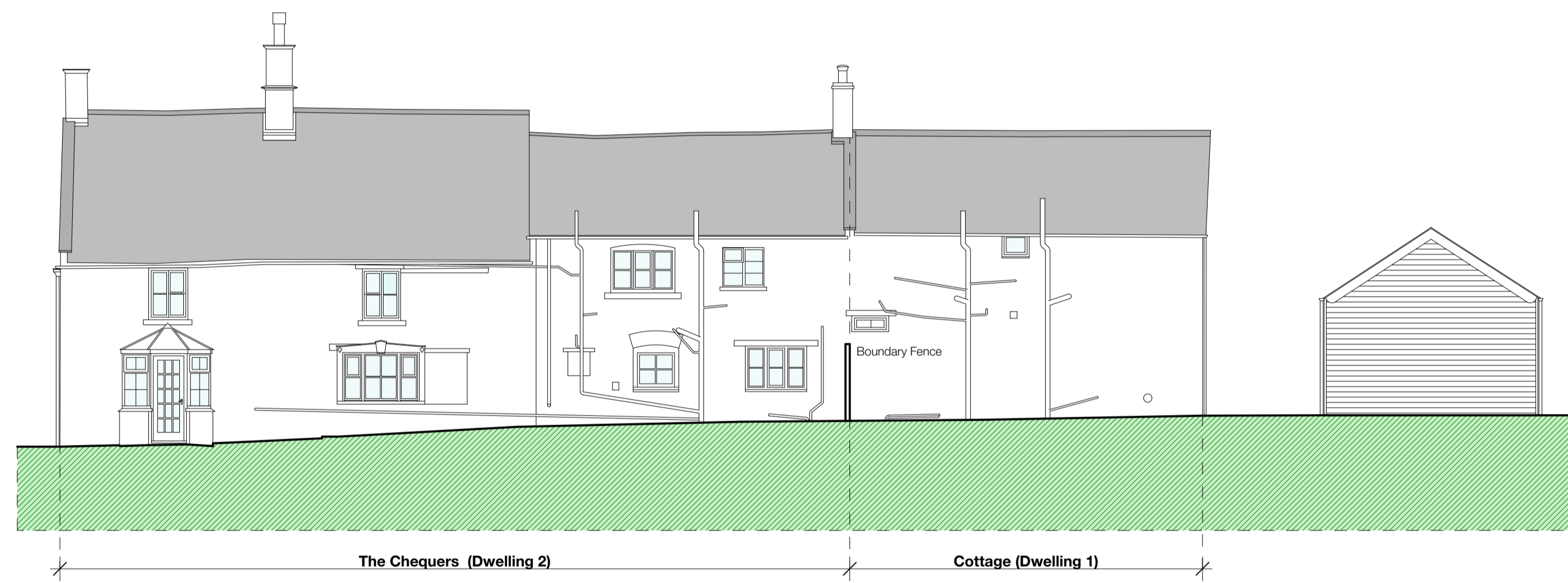
NORTH WEST ELEVATION (REAR)