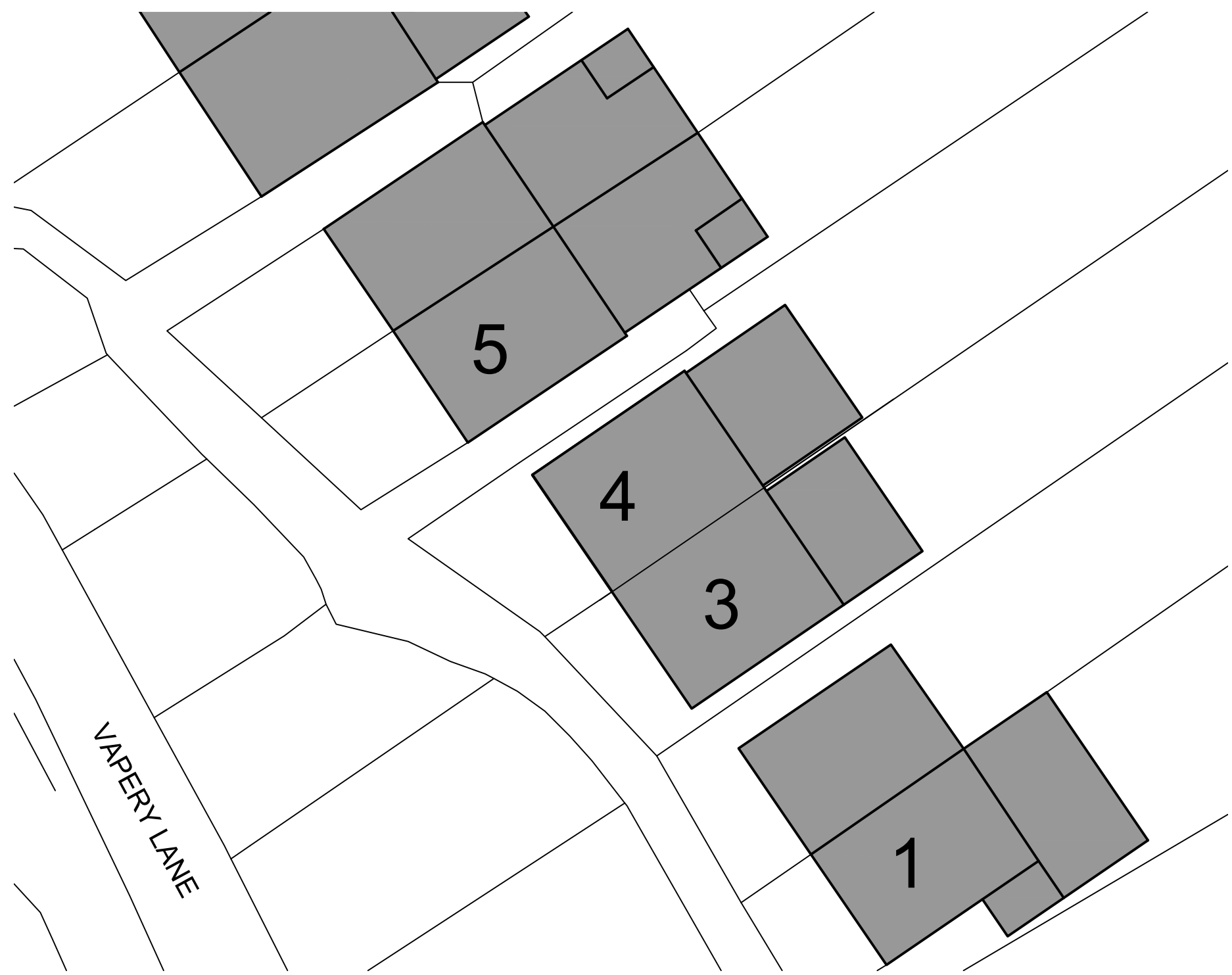
Block Plan - Existing Scale 1:200 @ A3