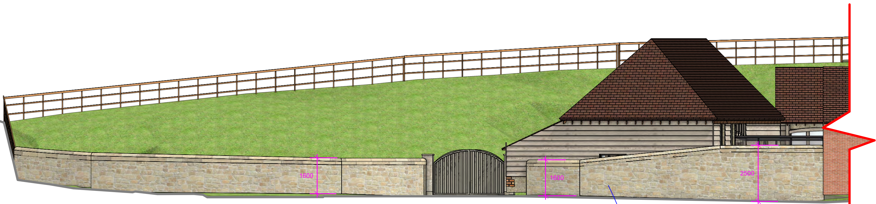
Proposed West Elevation - Northern Portion of Site (1:100)

Traditional stone wall built in the local vernacular to gradually taper from 1.6m to 2.5m in order to protect privacy and views into back garden