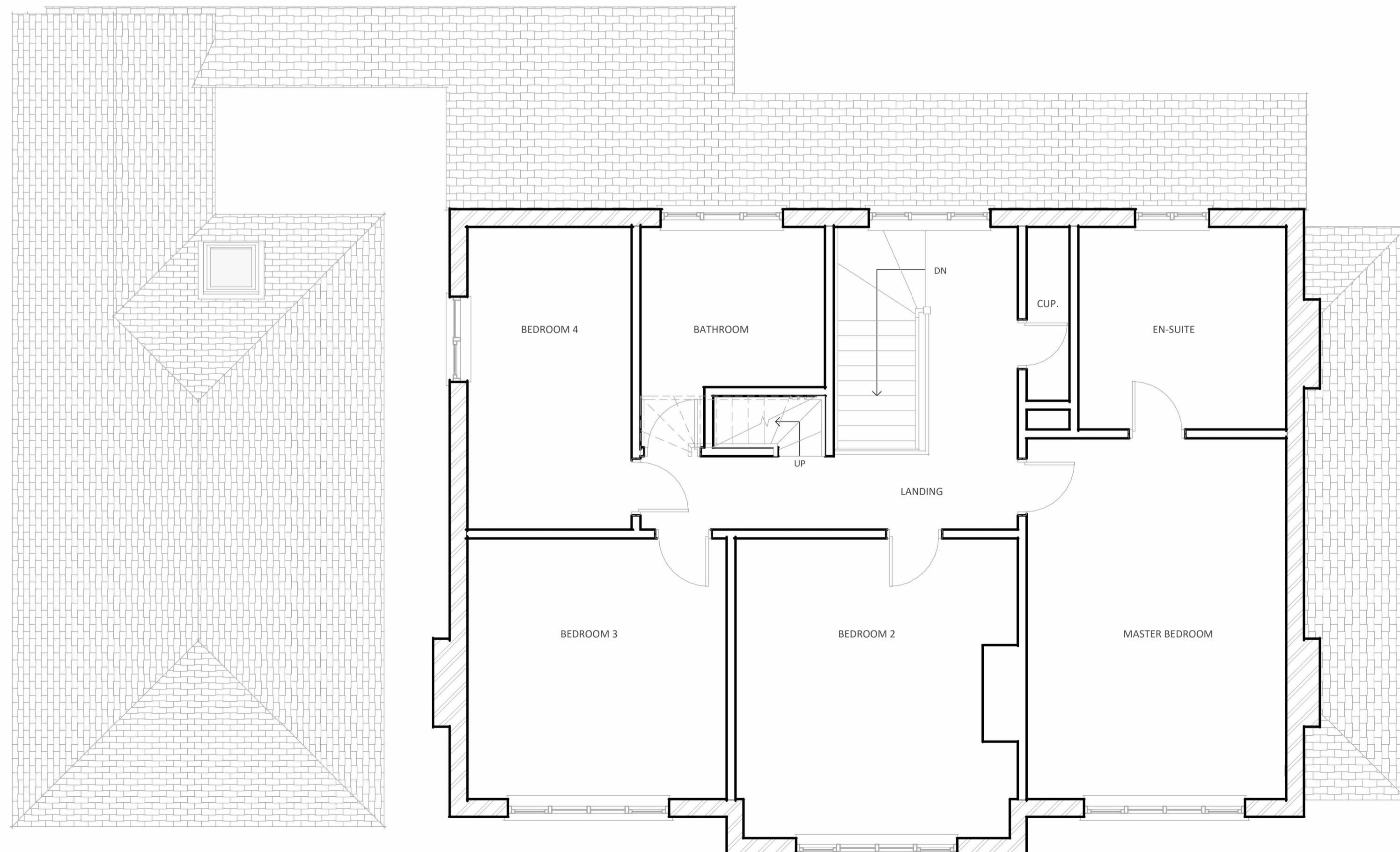
2 FIRST FLOOR PLAN