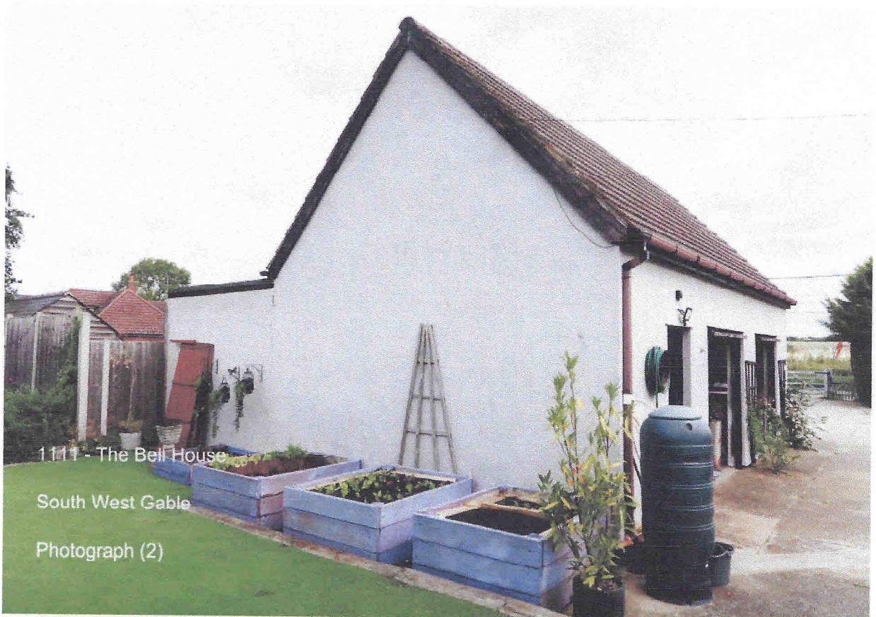
1111 - The Bell House