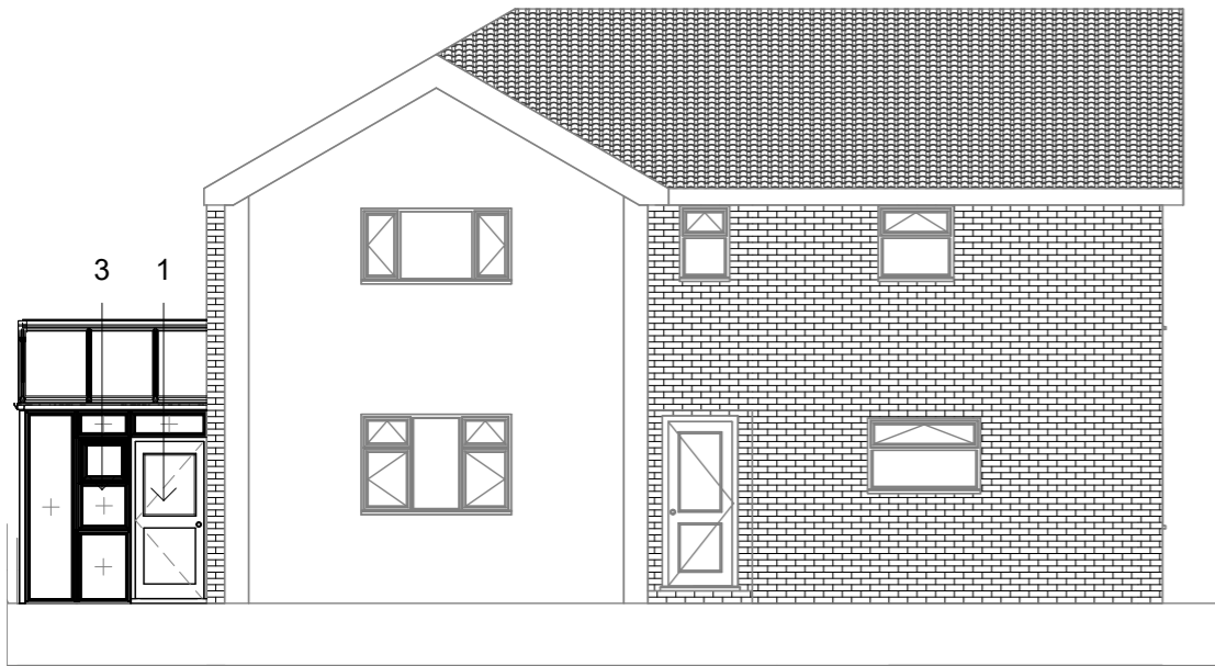
1 Front Proposed 1 : 100