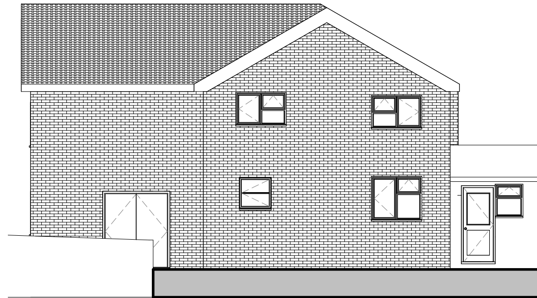
2 Rear Existing 1 : 100