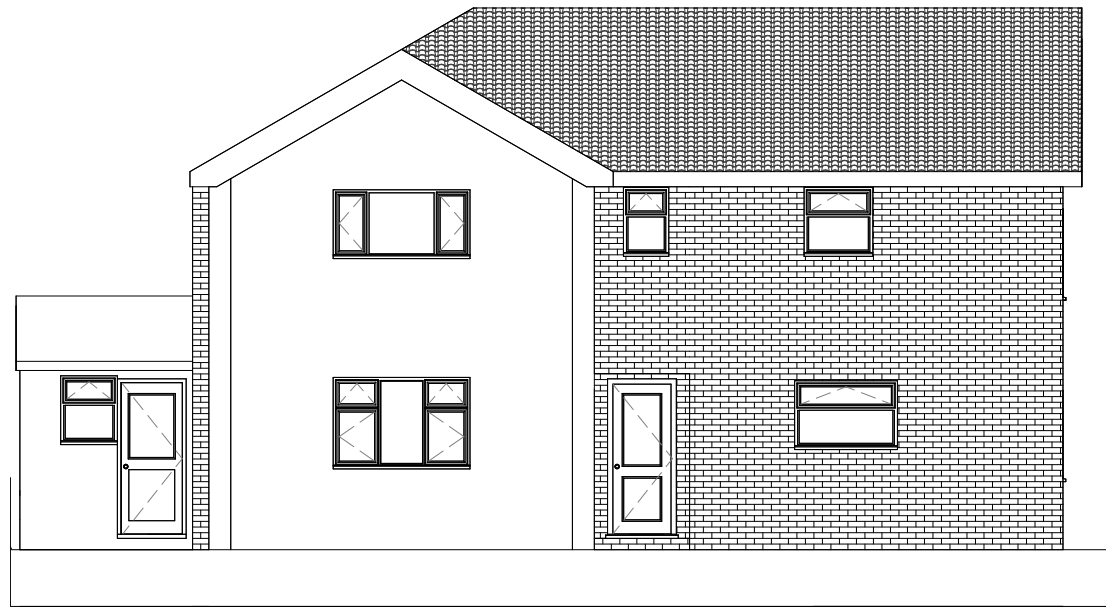
1 Front Existing 1 : 100