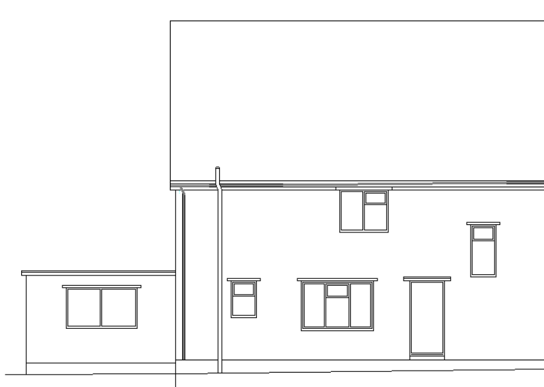
Existing Front Elevations 1-100