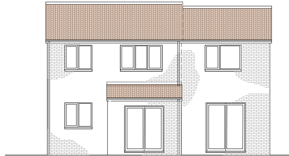
Proposed Rear Elevation. 1:100