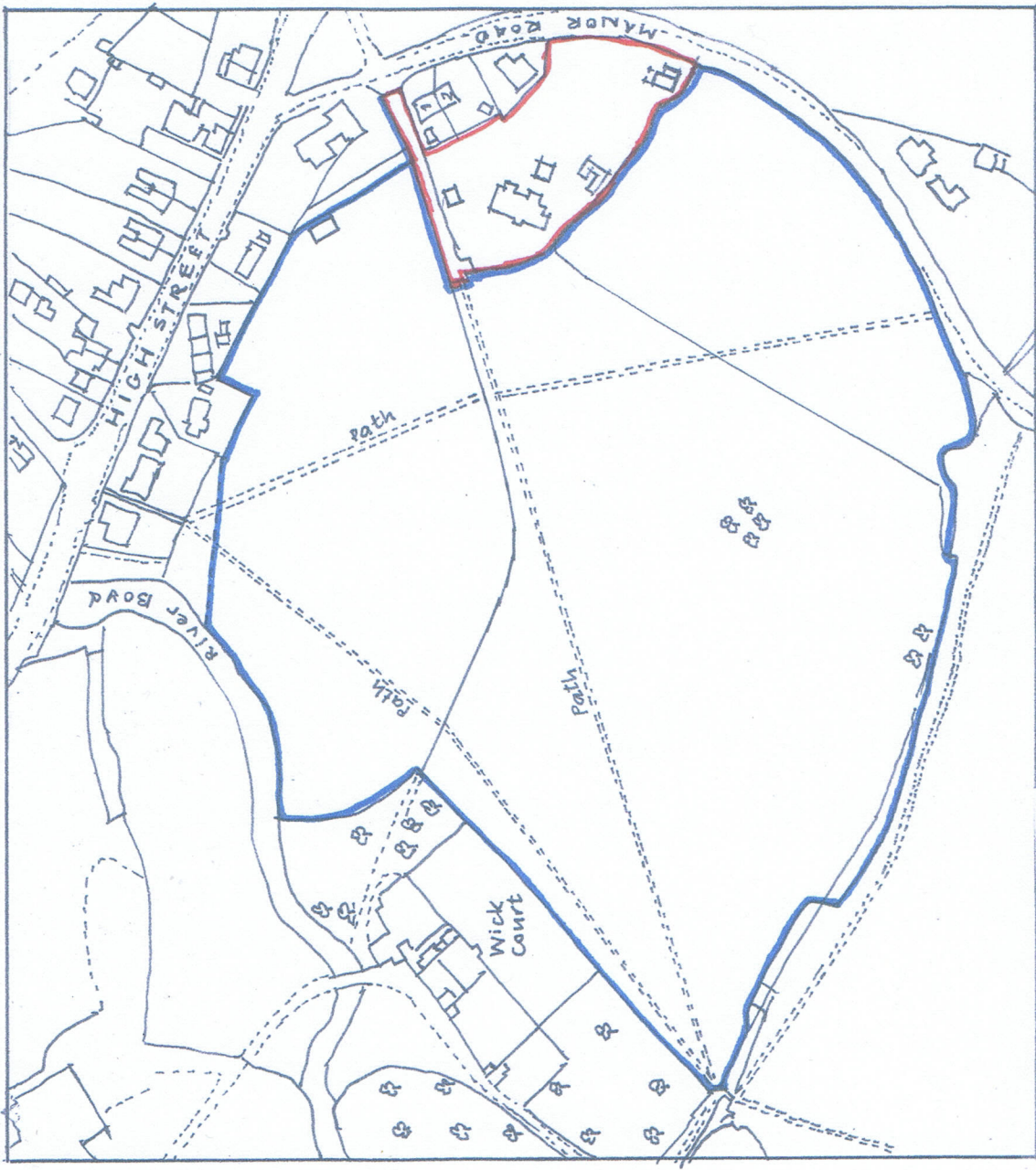
SITE PLAN 1:2500