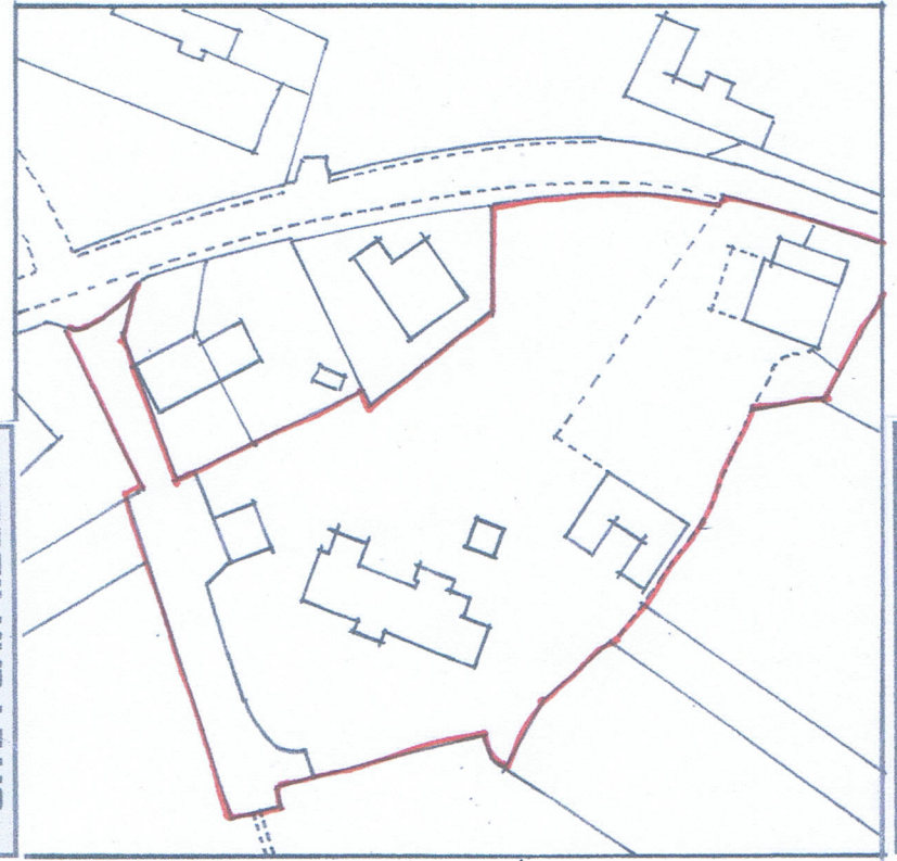
SITE PLAN 1:250