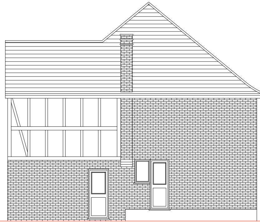
Existing Side Elevation Scale 1:100