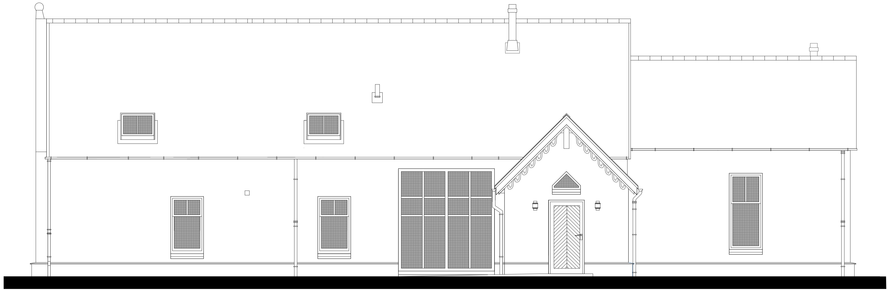
Elevation Facing Chapel Brae