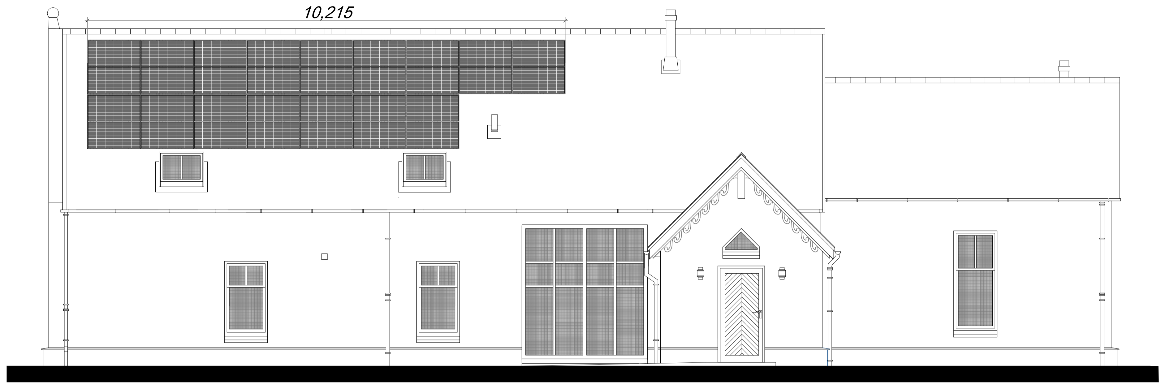
Elevation Facing Chapel Brae