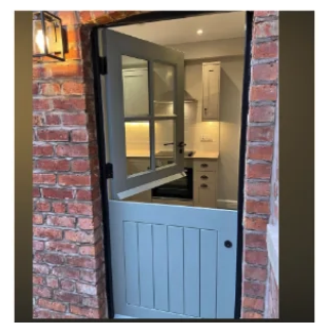
Figure 3: Example barn door for rear external door