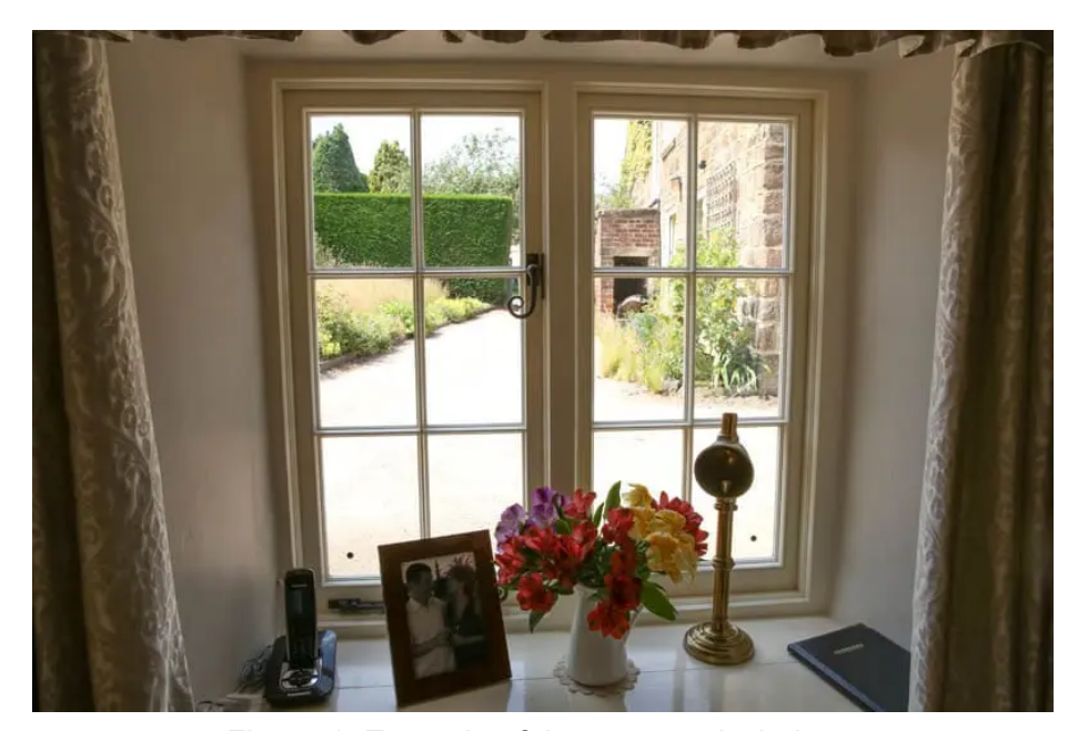
Figure 1: Example of the proposed windows