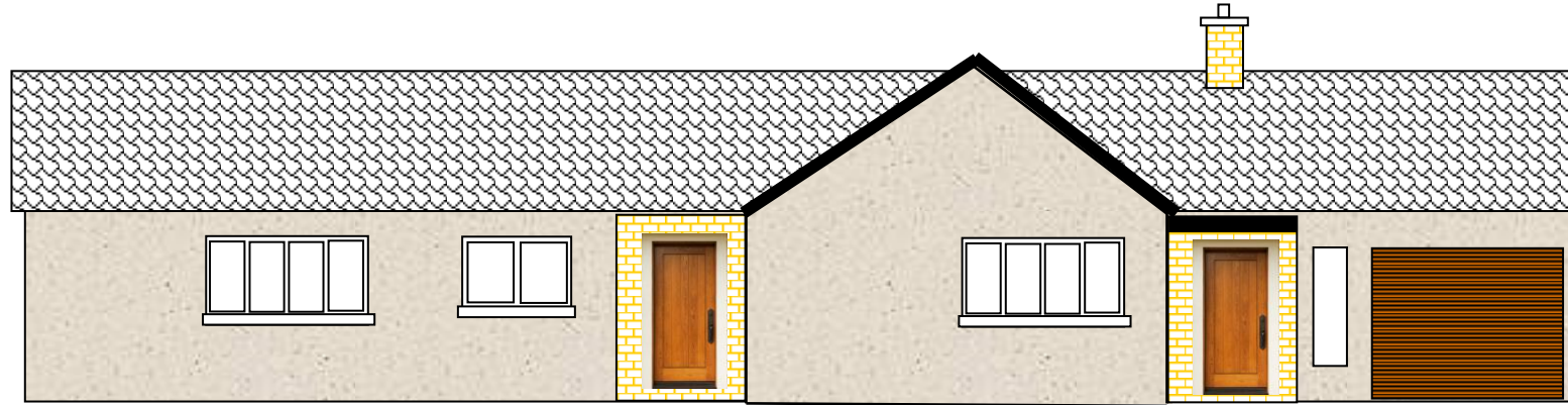
EXISTING SOUTH FACING ELEVATION