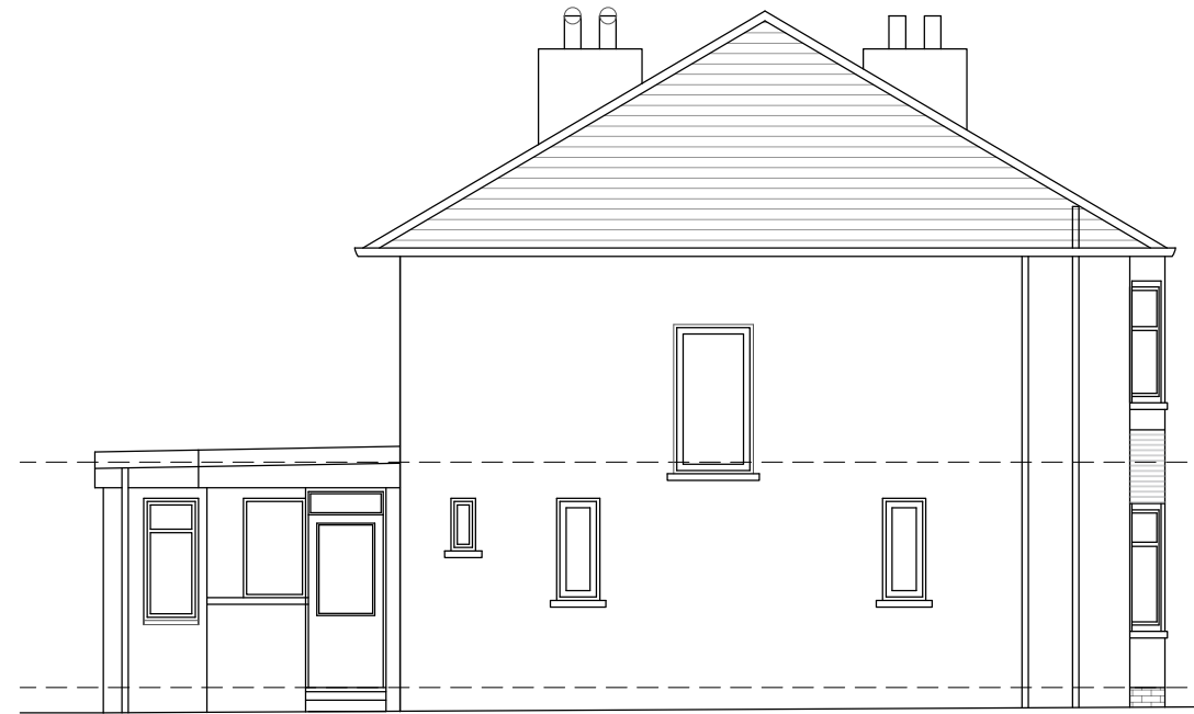
SIDE ELEVATION AS EXISTING