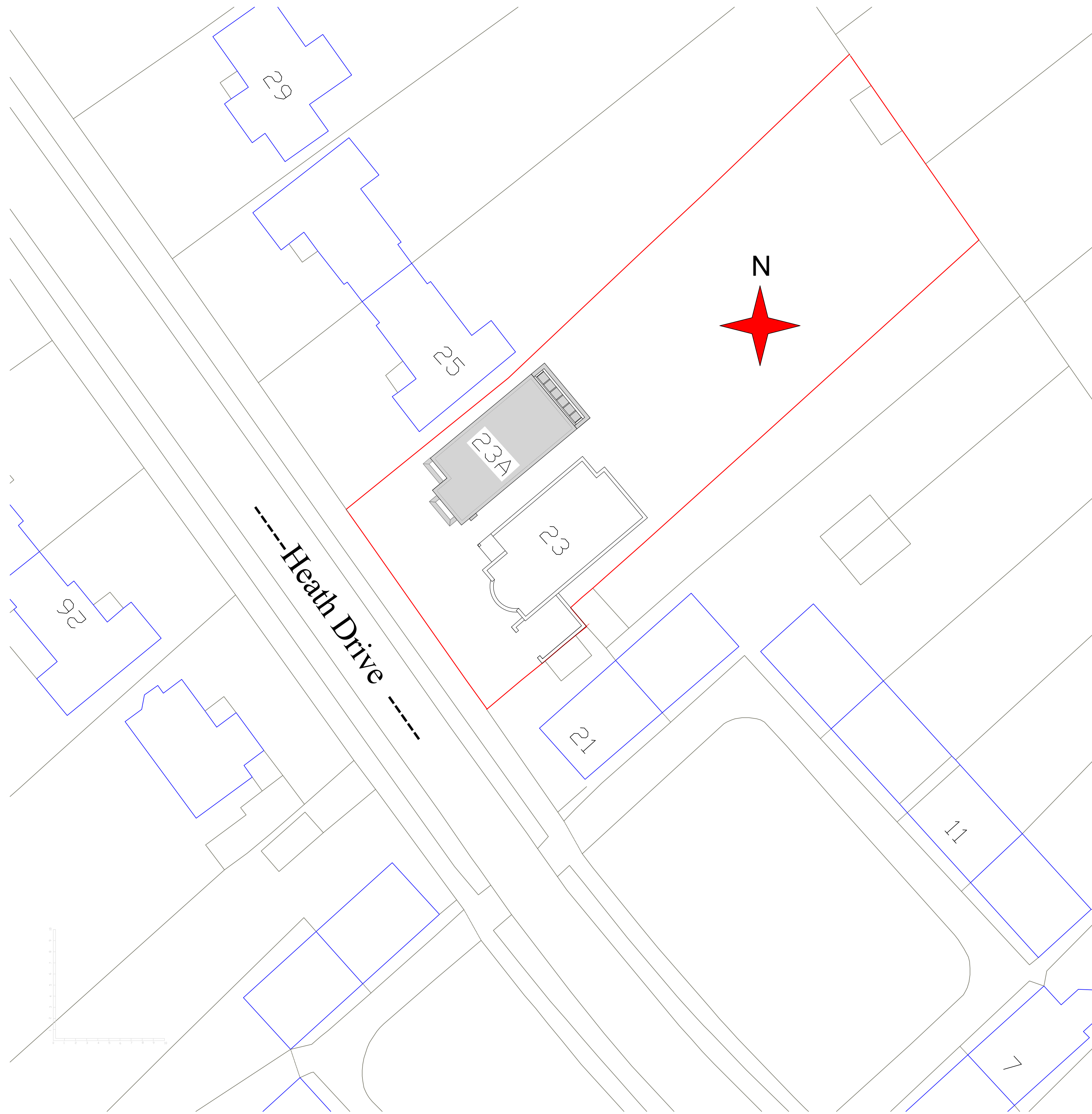
BLOCK PLAN SCALE 1:200