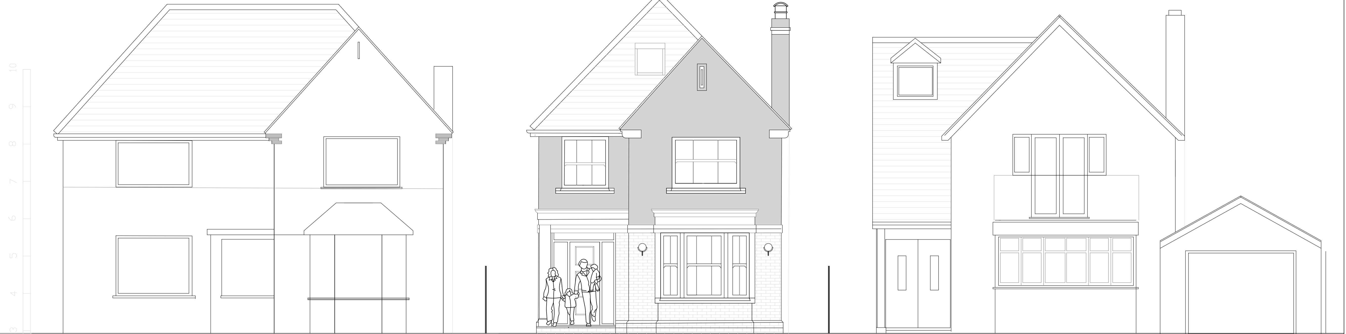
25 HEATH DRIVE

NOTES: All dimensions must be checked on site and not based on this drawing.