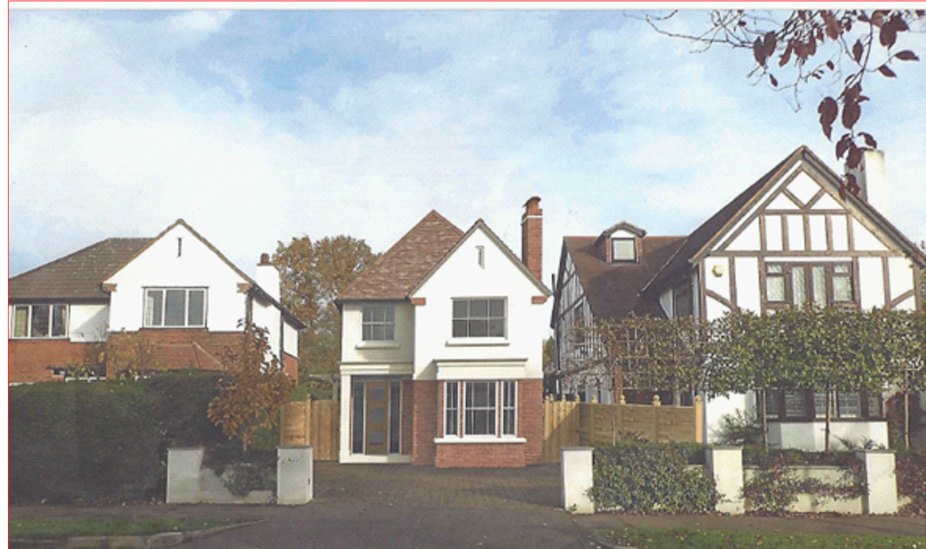
STREET VIEW VISUALIZATION

anatolitis associates MEADOWCROFT STUDIO 28 MANOR ROAD, POTTERS BAR HERTFORDSHIRE EN6 1DQ email: admin@anatolitis.co.uk tel: 01707 659357