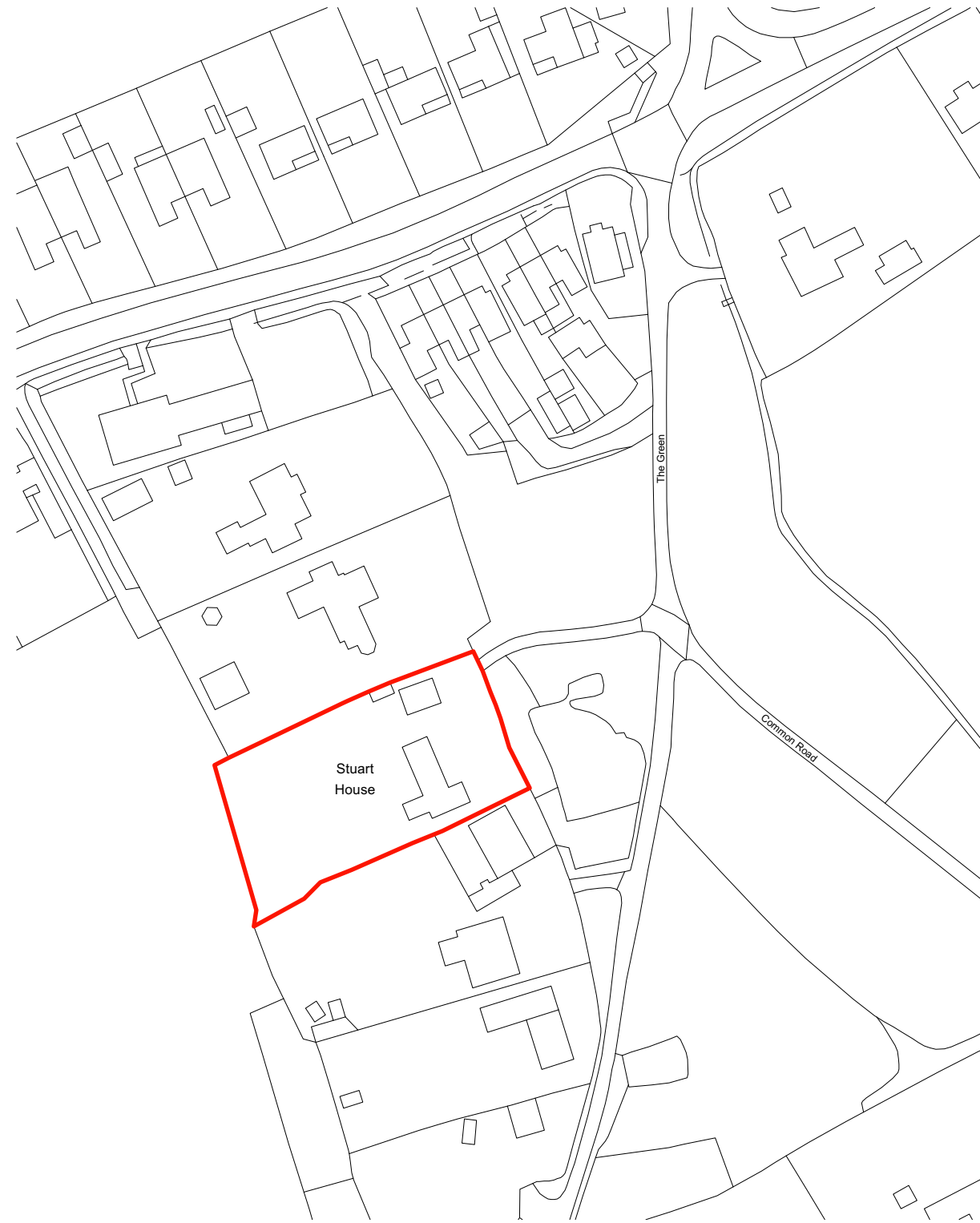
1 Site Location Plan Scale: 1:1250