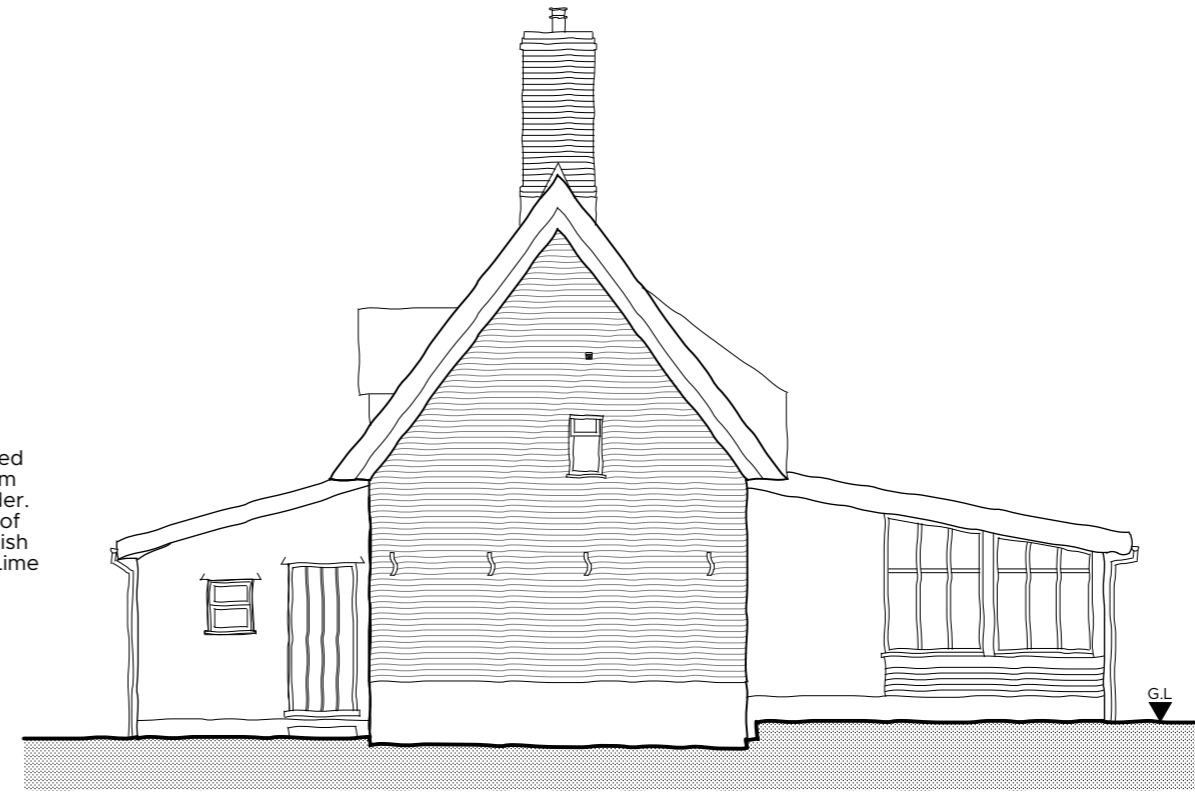
2 Proposed North - West Elevation Scale: 1:100