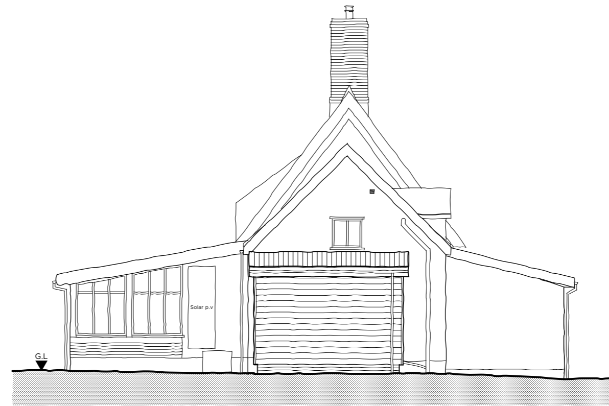
4 Proposed South - East Elevation Scale: 1:100