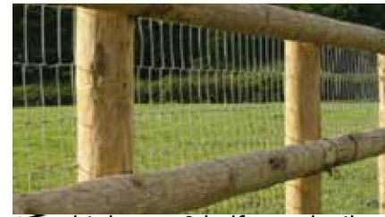
1.2m high post & half round rail stock fencing