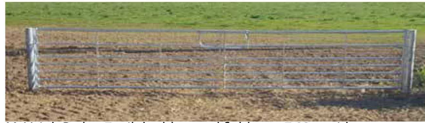
McVeigh Parker 7 rail double metal field gate 7.93m wide

Proposed Planting Plan & Fencing Details November 2023 Scale 1:200 (A3) 408-05A