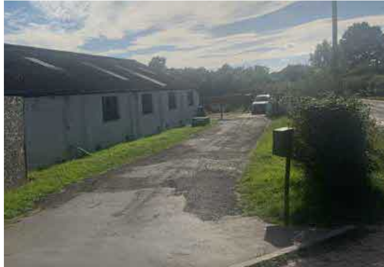
View D Existing entrance to Clockhouse Farm