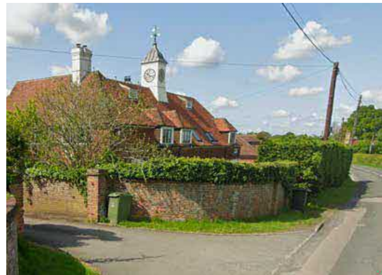
View E The Clock House and entrance to Printstile Place looking west along Penshurst Road