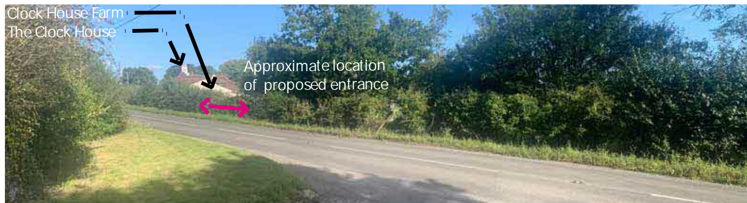
View F From Ashour Lodge looking across Penshurst Road towards proposed new entrance