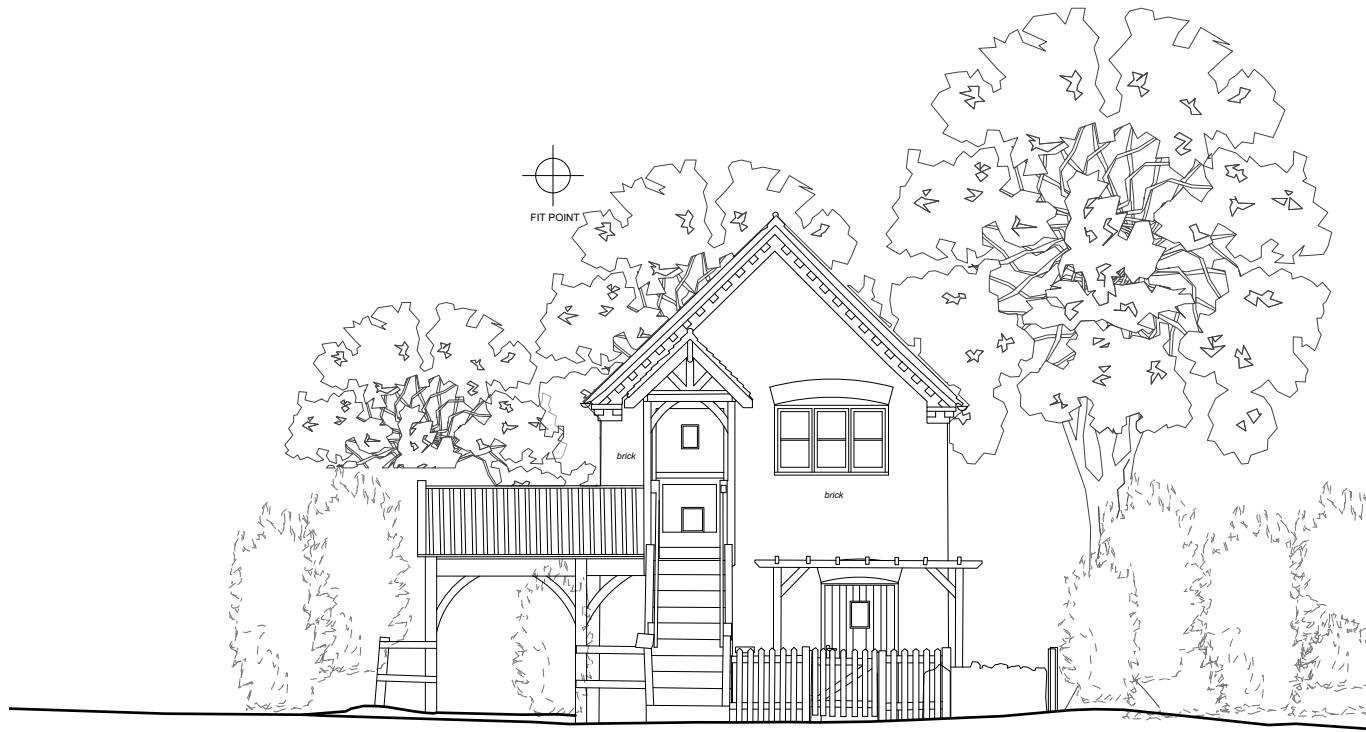
FRONT ELEVATION (STREET VIEW)