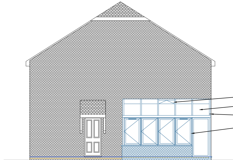
Proposed South side elevation