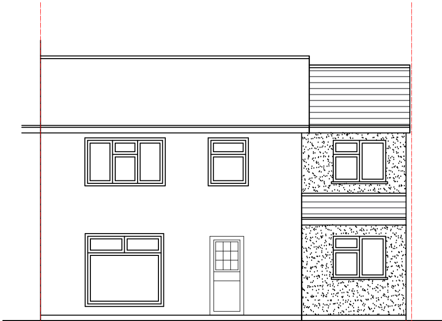
APPROVED PROPOSED FRONT ELEVATION