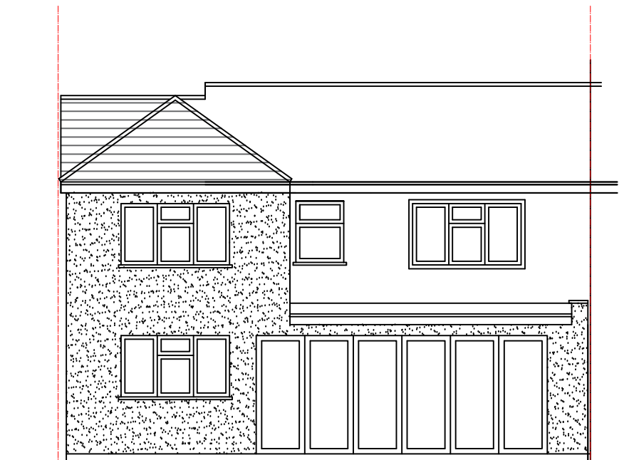
APPROVED PROPOSED REAR ELEVATION