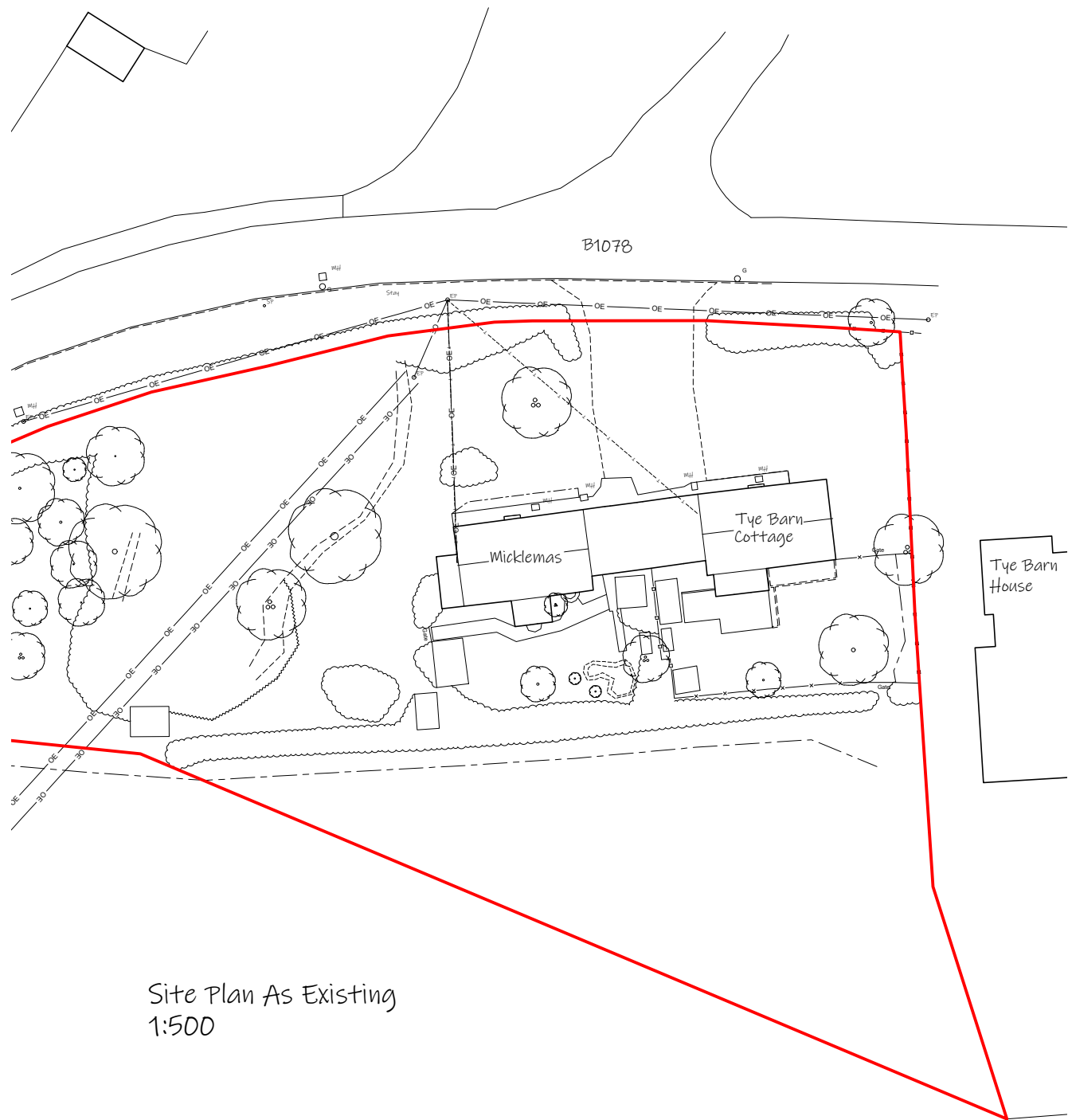
Site Plan As Existing 1:500