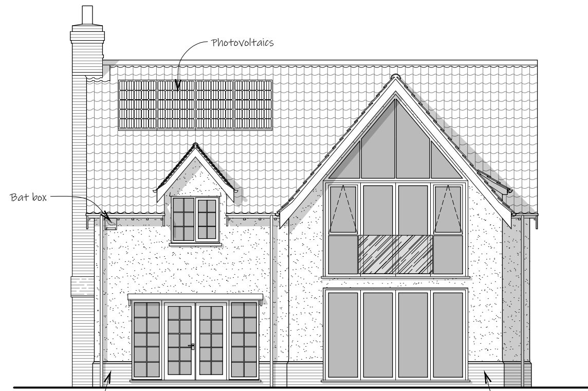
Rear Elevation (South)