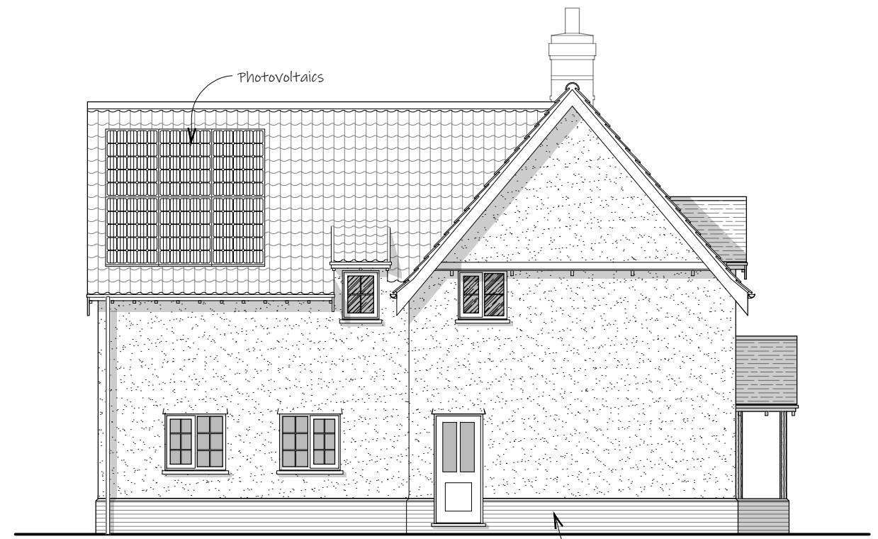
Side Elevation (East)