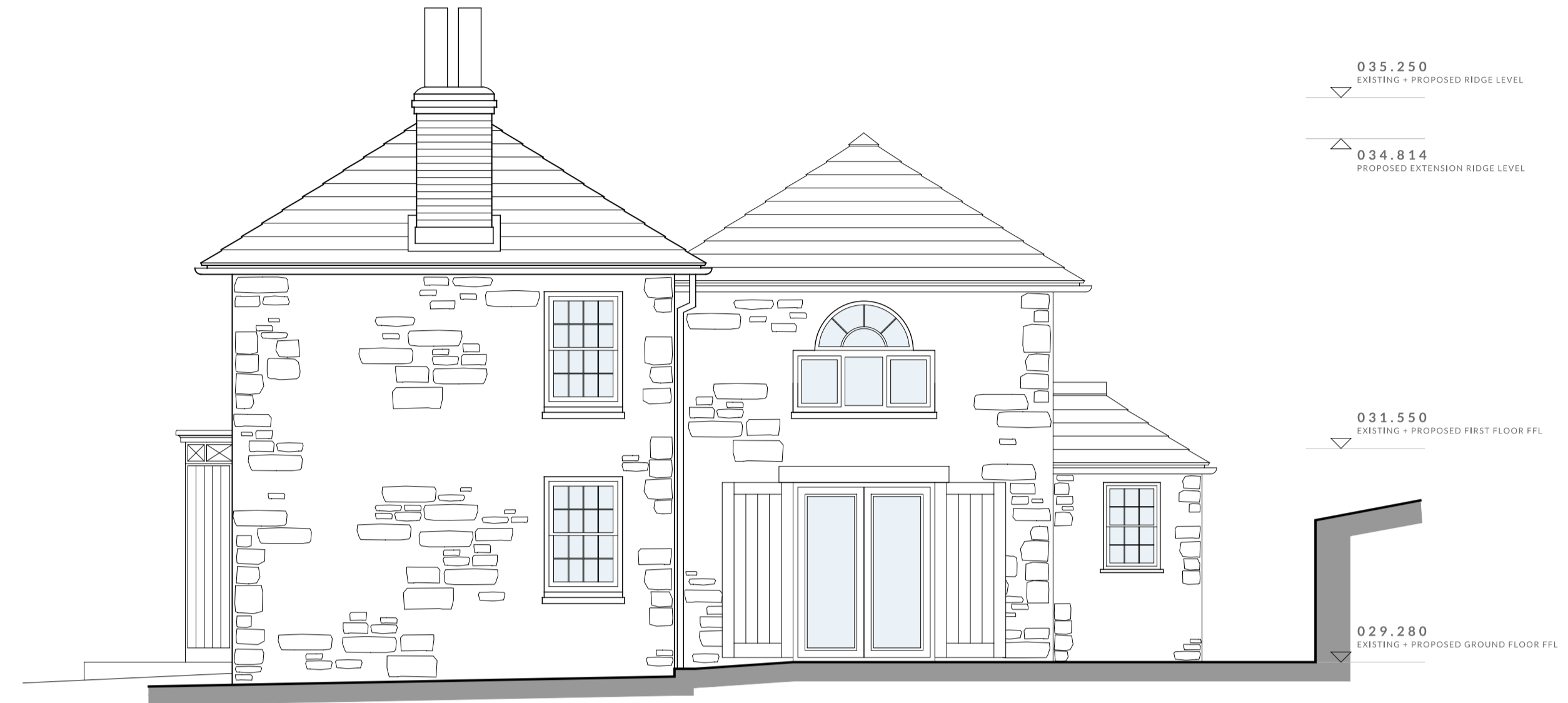
PROPOSED SOUTH ELEVATION 1 : 50