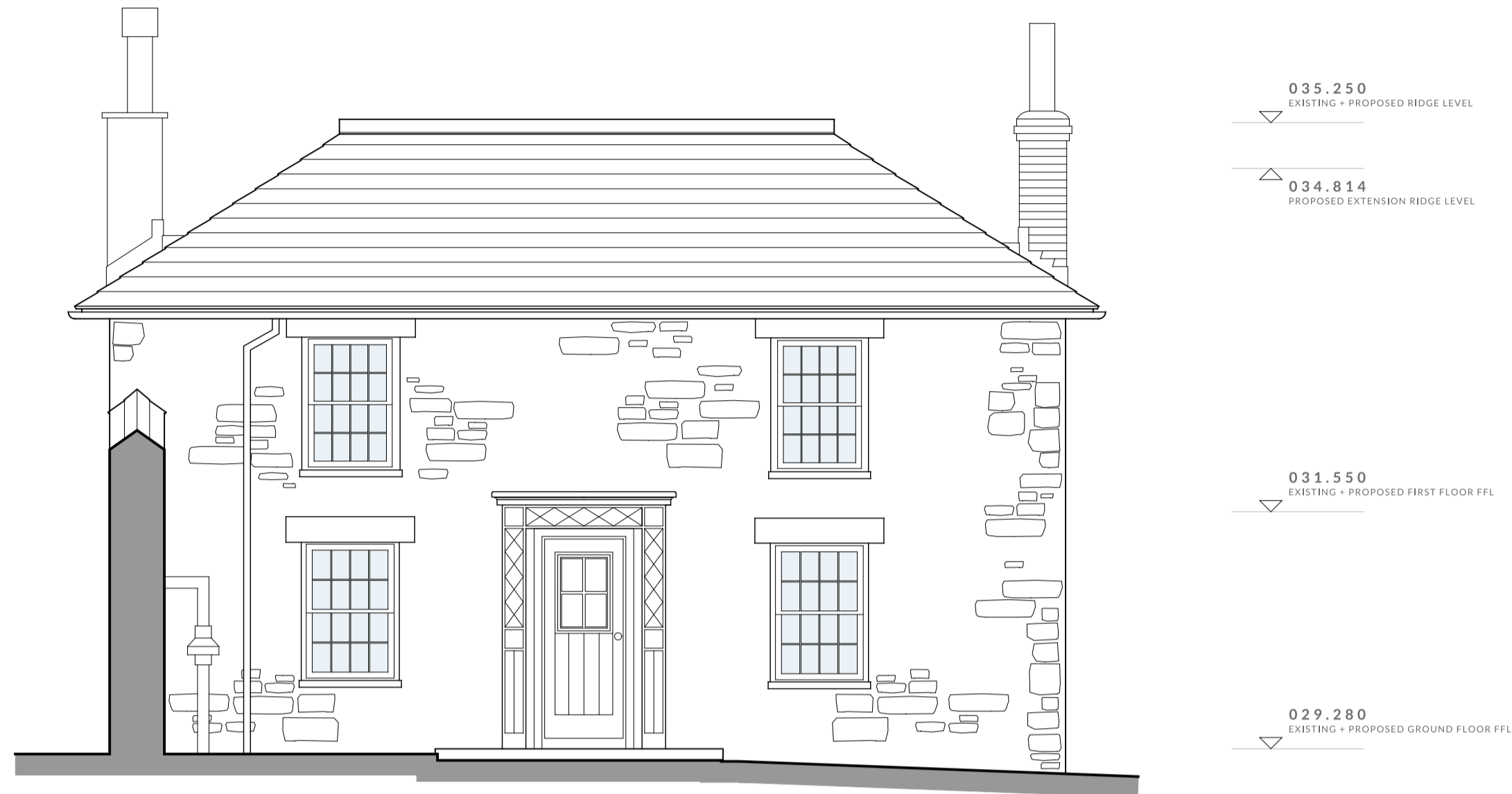
PROPOSED WEST ELEVATION 1 : 50