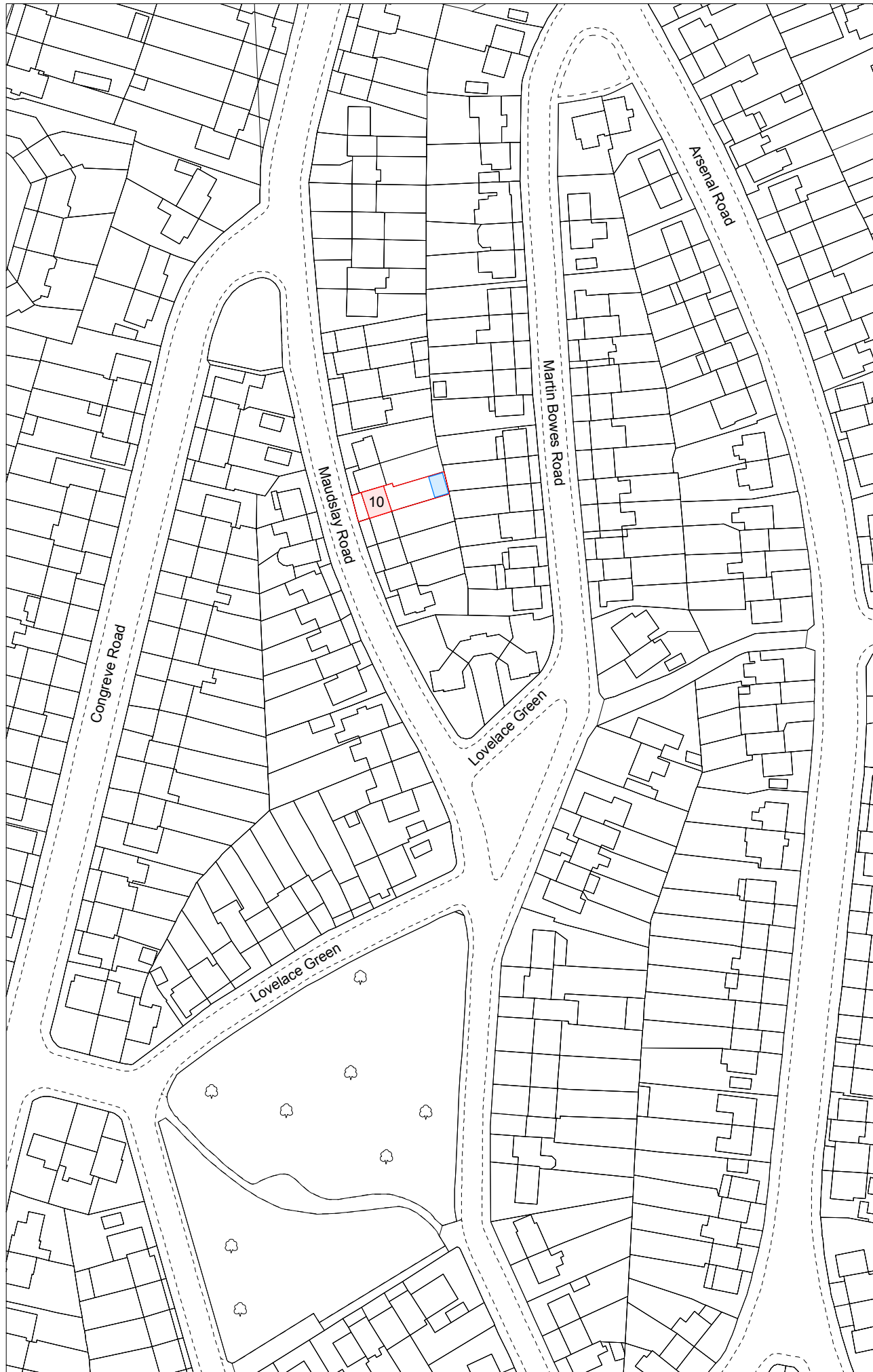
7 Site Plan Scale 1:1250