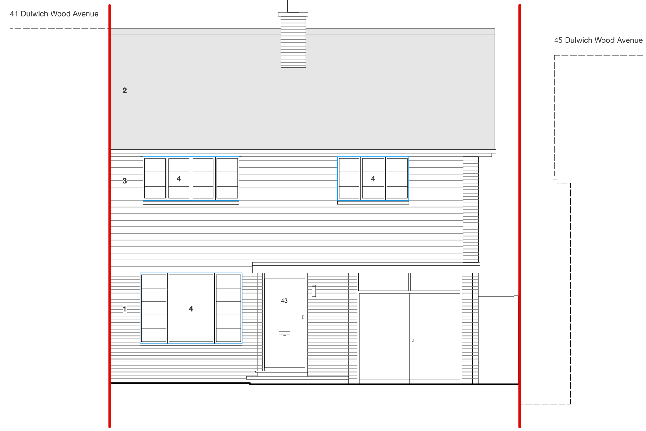
01 Front Elevation 032-A-030 Existing