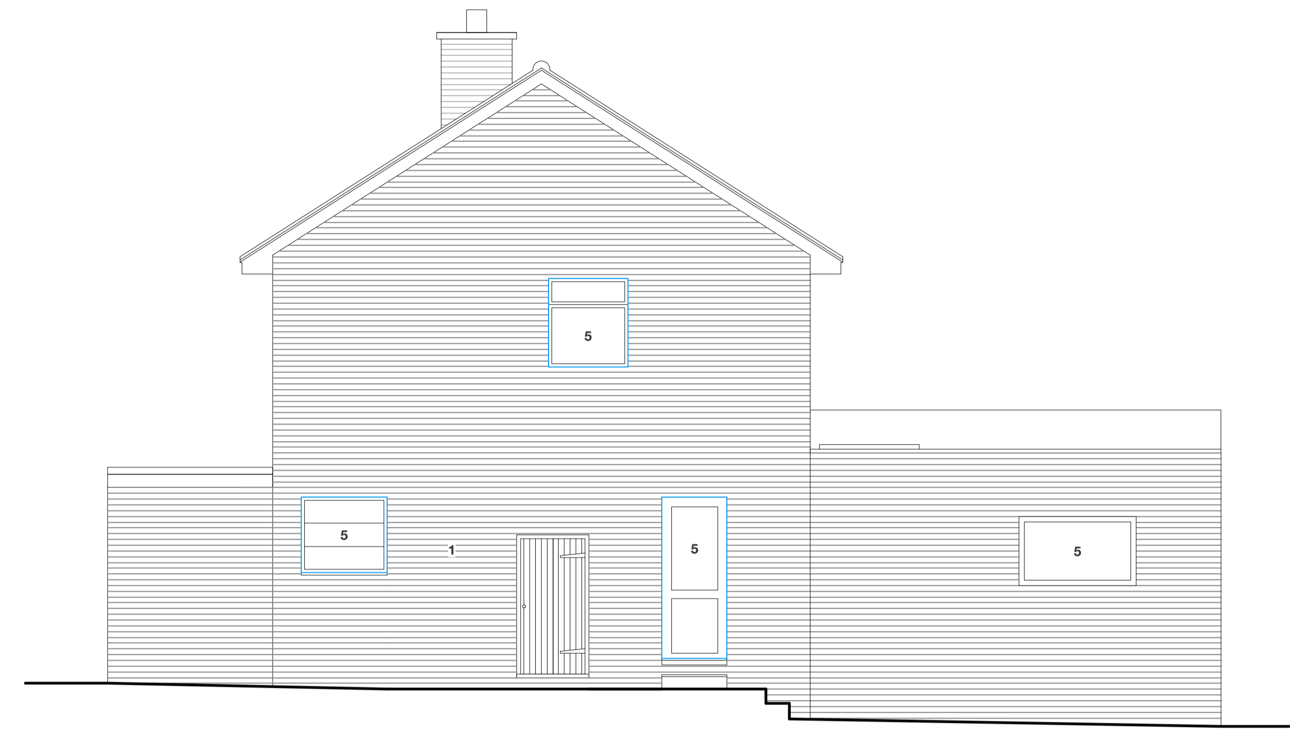
02 Side Elevation 032-A-030 Existing