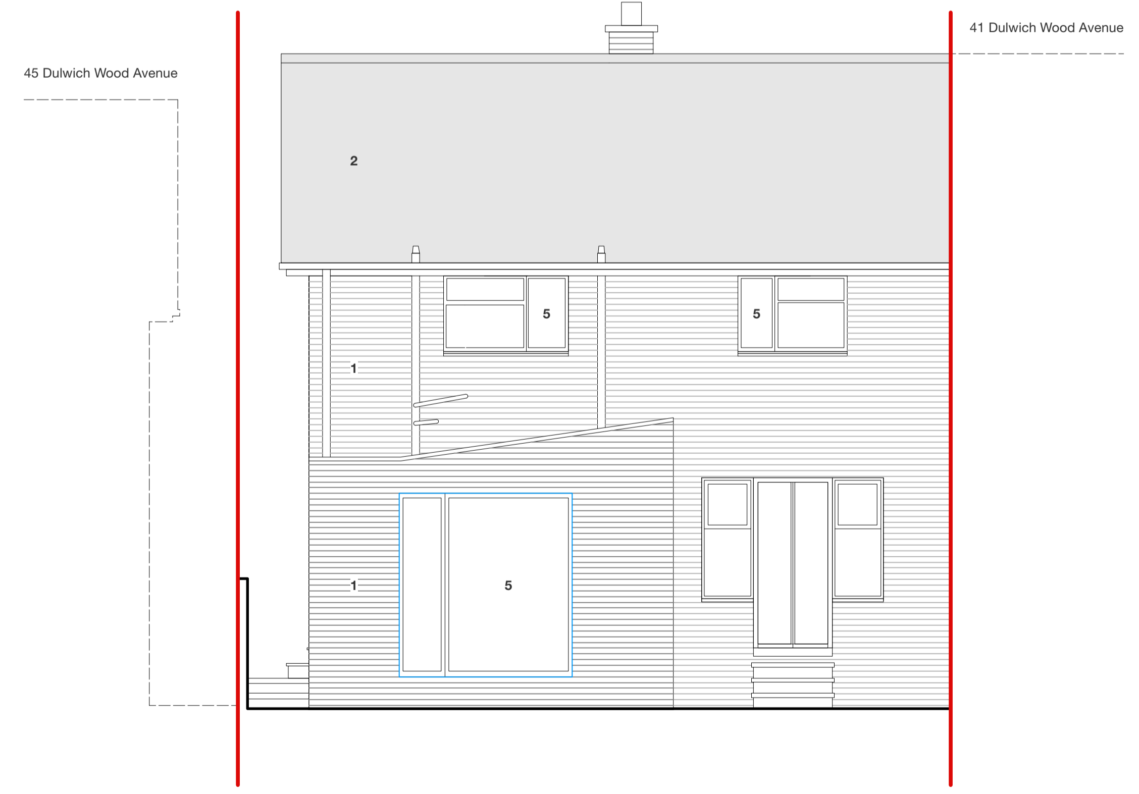
03 Rear Elevation 032-A-030 Existing