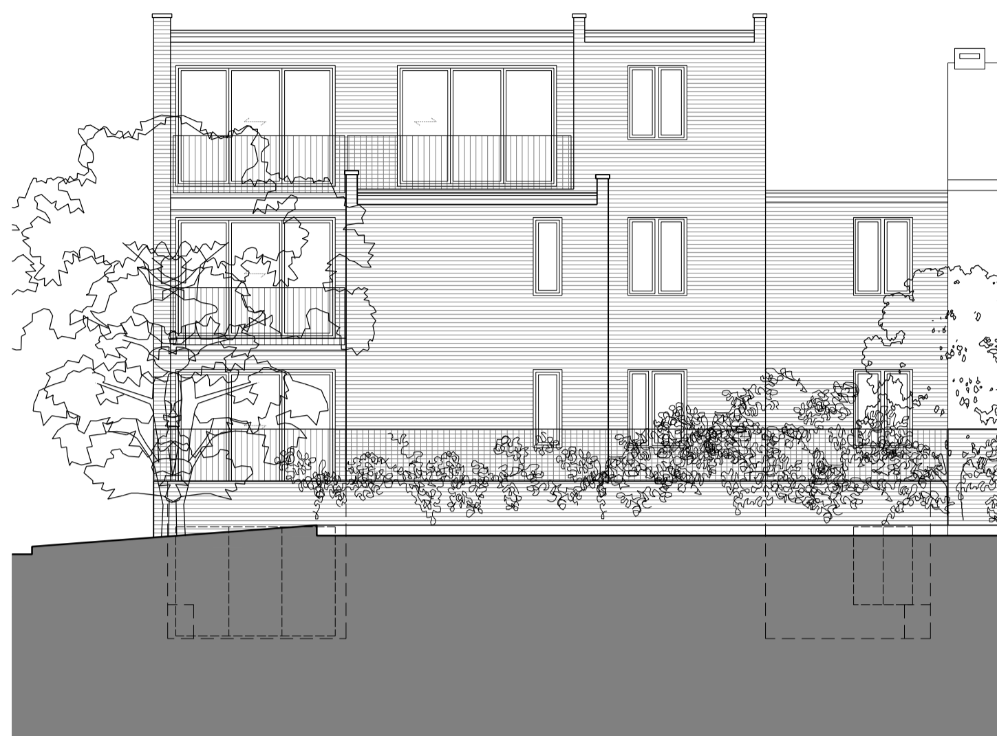
03 Southeast Elevation: Existing