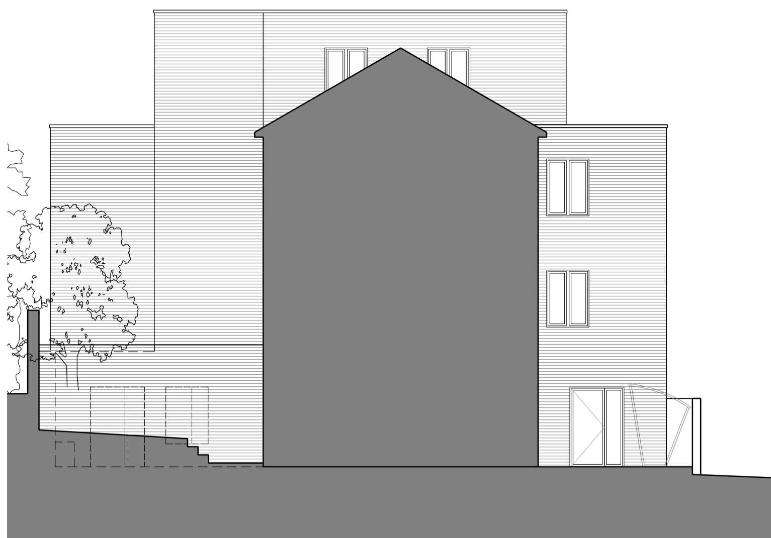
02 Northeast Sectional Elevation: Existing