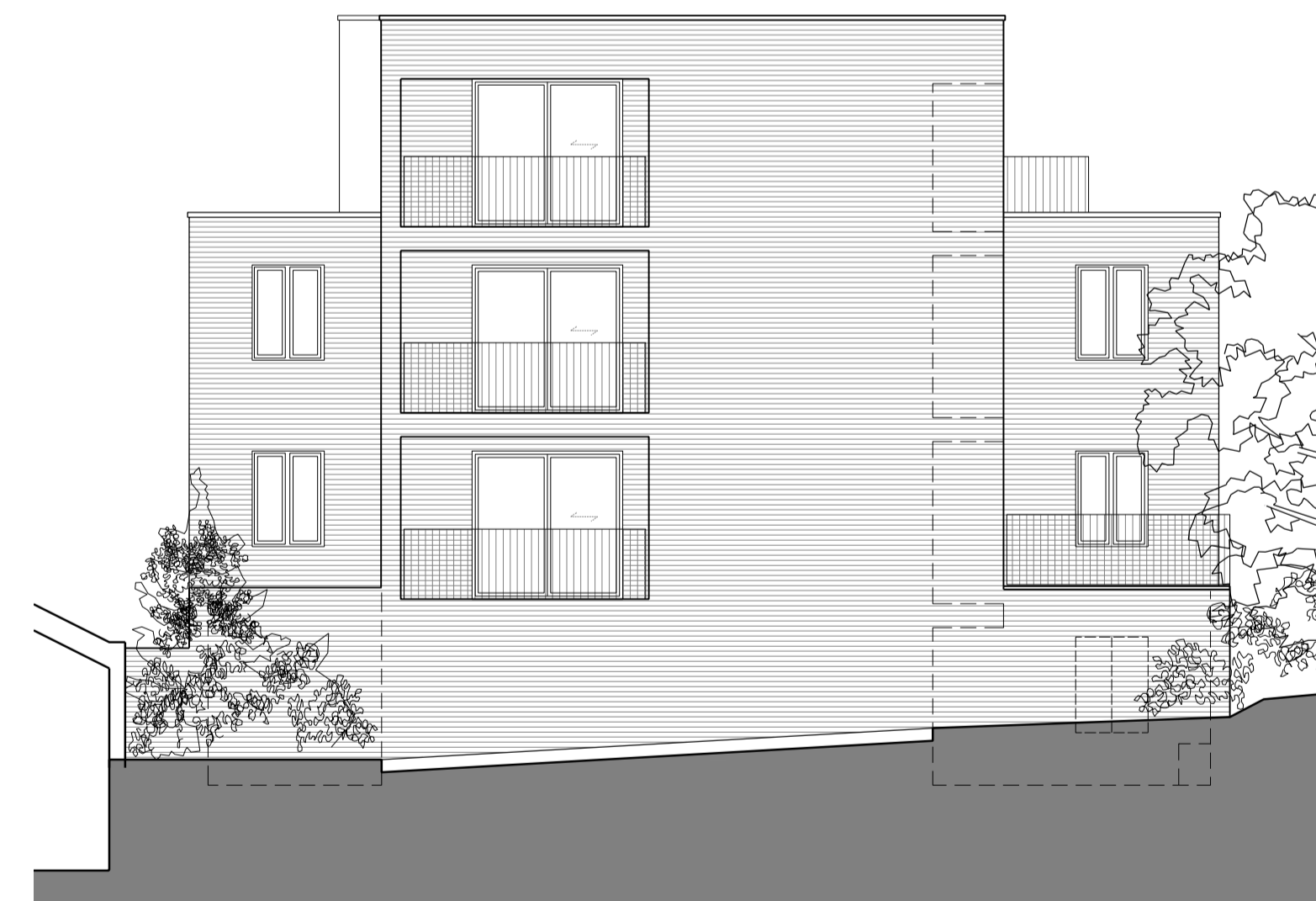
08 Southwest Elevation: Proposed