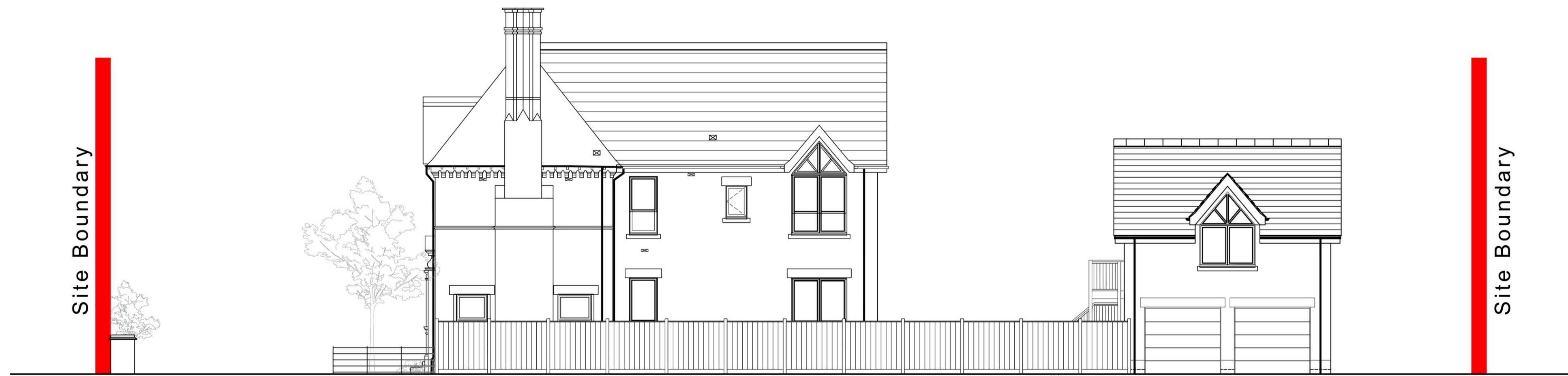
Existing Street Scene SCALE: 1:100