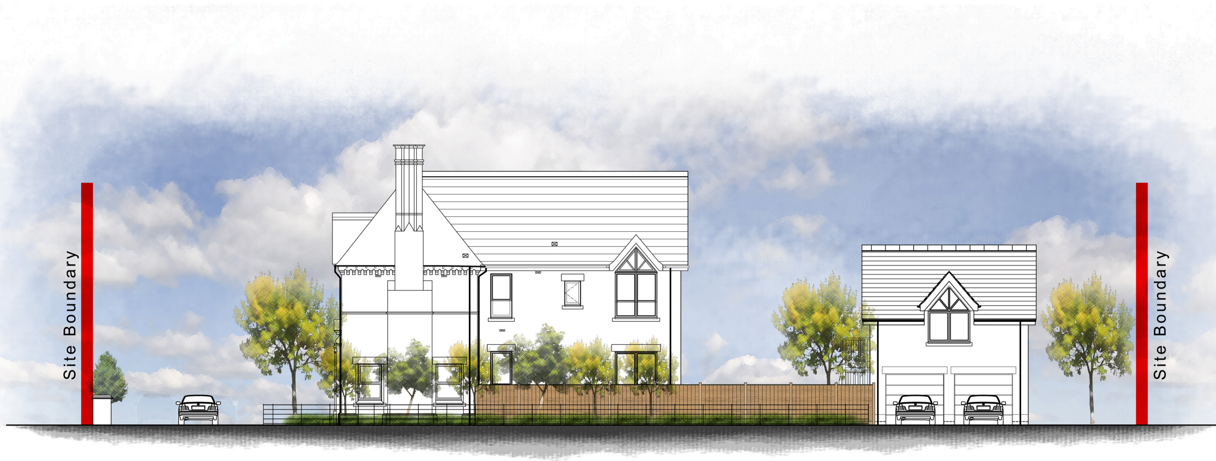
Proposed Street Scene SCALE: 1:100

General Notes Drawing based on Ordnance Survey and Measured Survey data. Responsibility is not accepted for errors made by others in scaling from this drawing. All drawing information should be taken from figured dimensions only. Drawing to be used for Local Authority purposes or for Planning only.