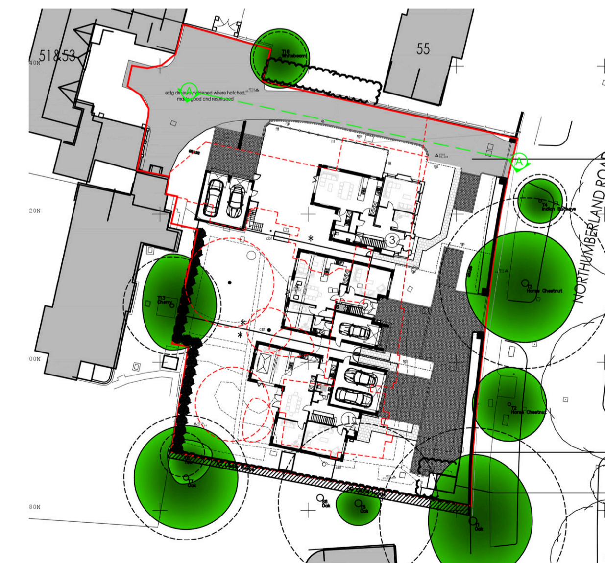
Site Plan SCALE: 1:500