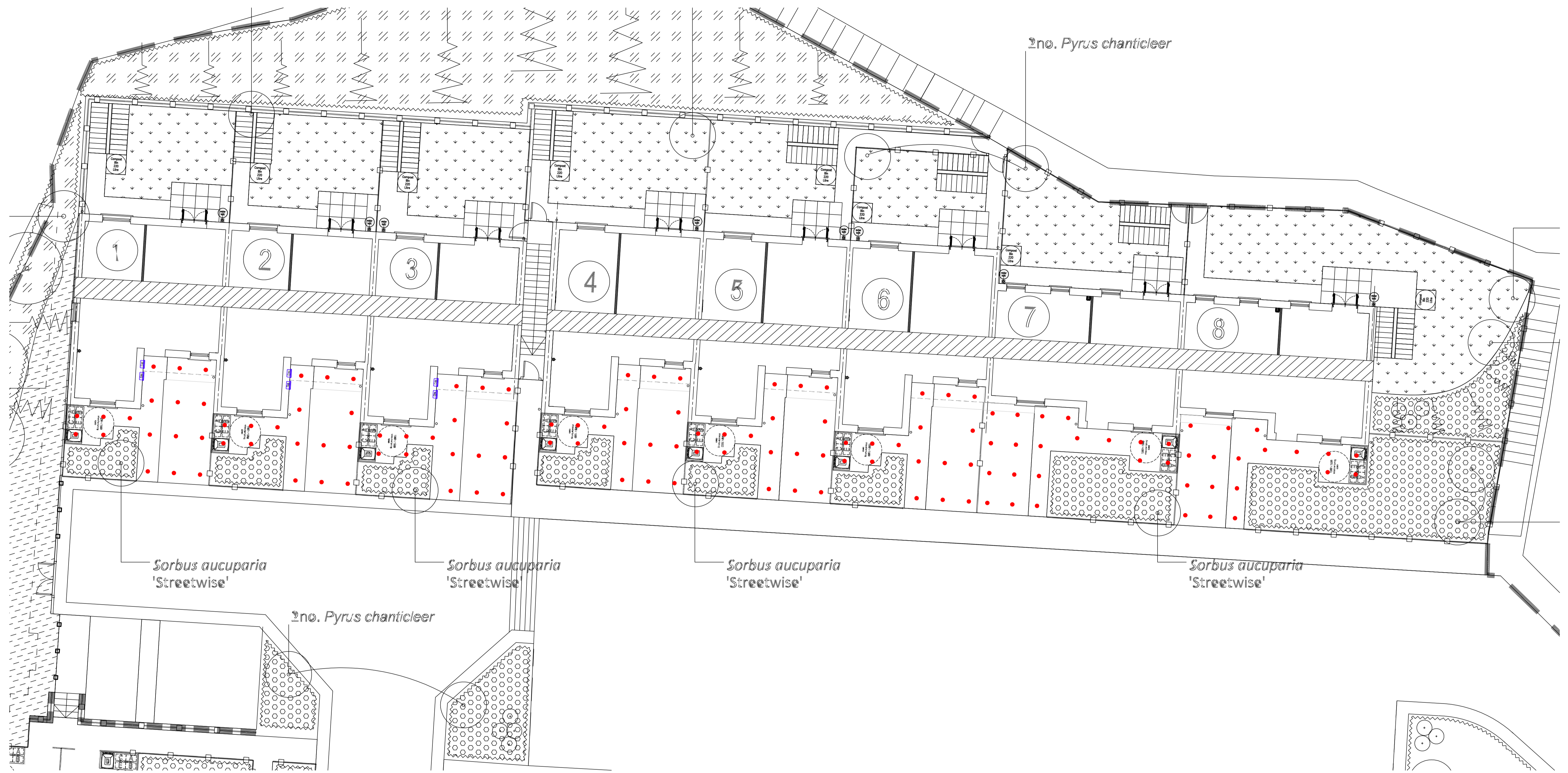
PART PLAN Scale 1:100 © A1