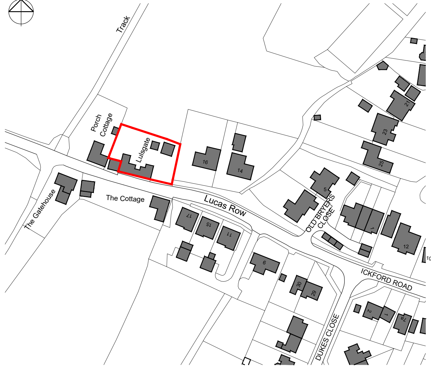
EXISTING LOCATION PLAN - 1:1250