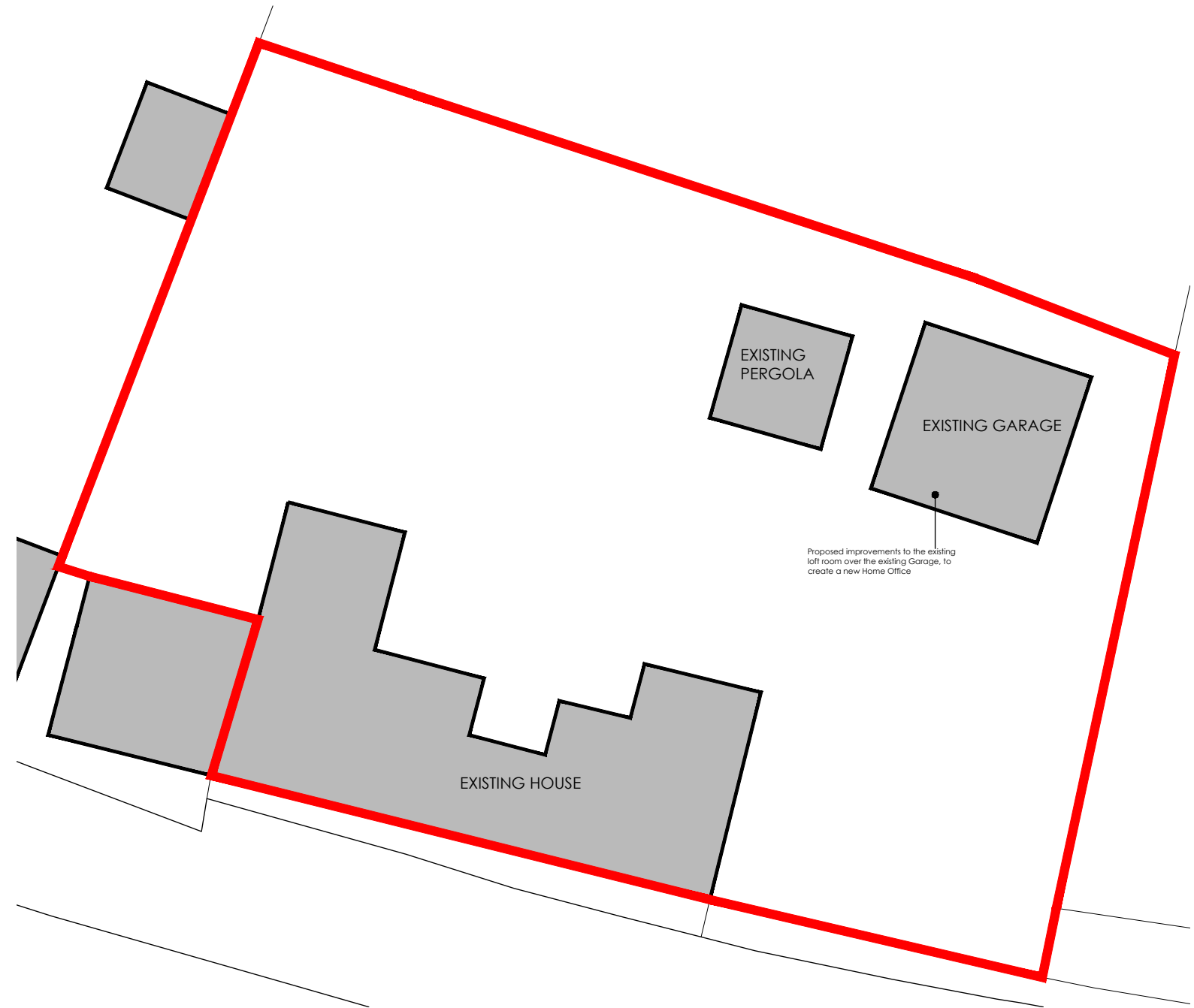
PROPOSED SITE/BLOCK PLAN - 1:200

CLIENT Mr & Mrs Adams JOB NO. W2196 JOB TITLE Luisgate Ickford Road Shabbington