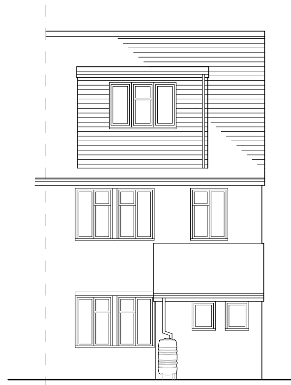
Proposed South West (Rear) Elevation