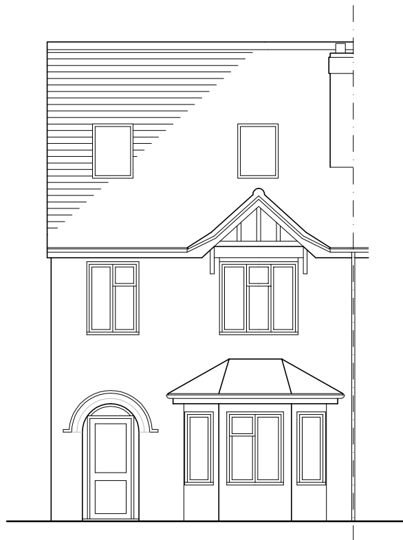
Proposed North East (Front) Elevation

THIS DRAWING IS THE COPYRIGHT OF THE COX CLIFFORD PARTNERSHIP AND MAY NOT BE REPRODUCED WITHOUT THEIR PRIOR PERMISSION.