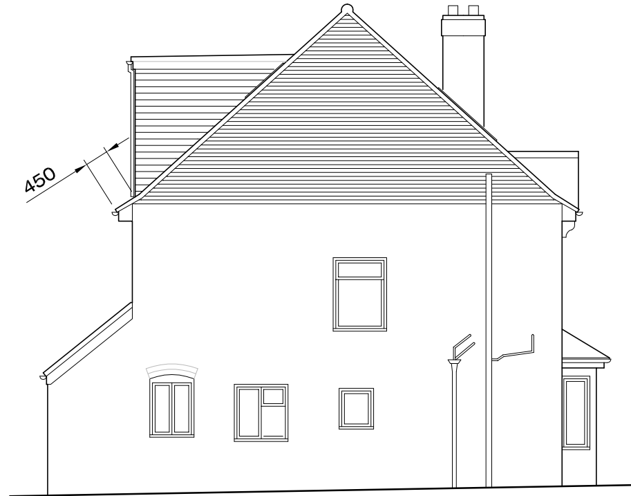
Proposed South East (Side) Elevation