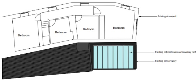
Existing Floor plans scale 1:50