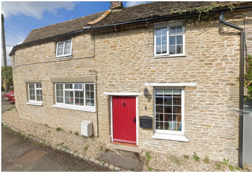
3 MILTON PLACE, FAIRFORD, GLOUCESTERSHIRE

Whilst the house is in the Fairford Conservation Area, the replacement roof is part of an extension to the building that was carried out previously, and as such the replacement roof is more in keeping with the existing tiled roof of the building and does not impact upon the appearance of the existing listed building.