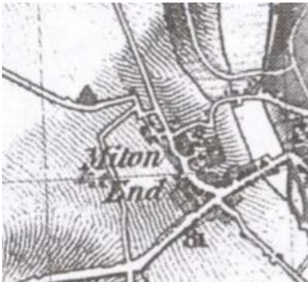
OS Map of Fairford 1828

The area that is known today is largely defined by intersecting roads however, the buildings grew up around the river crossing, the 'fair ford' and the buildings seen today date from the 18 th Century.