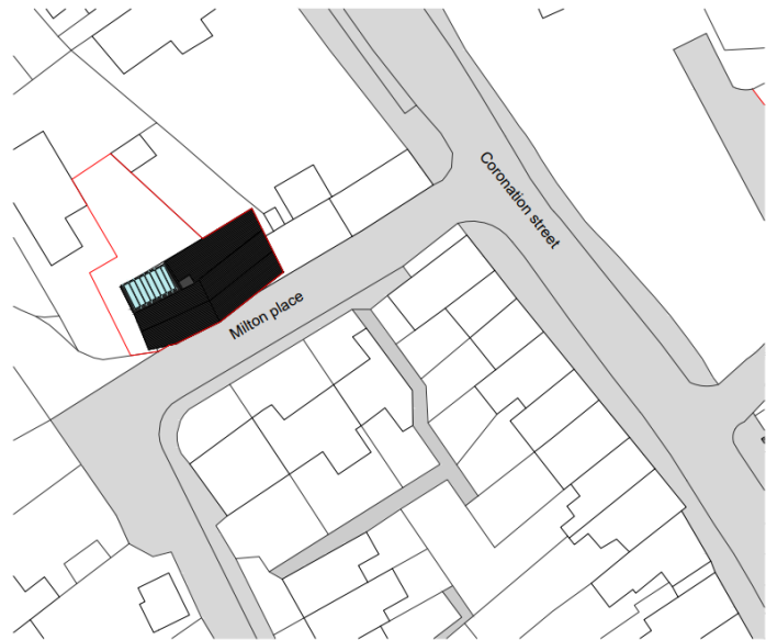
Existing Site plan scale 1:200