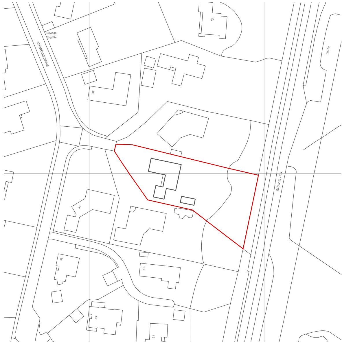
001 | site location plan | 1:1250 @ A3