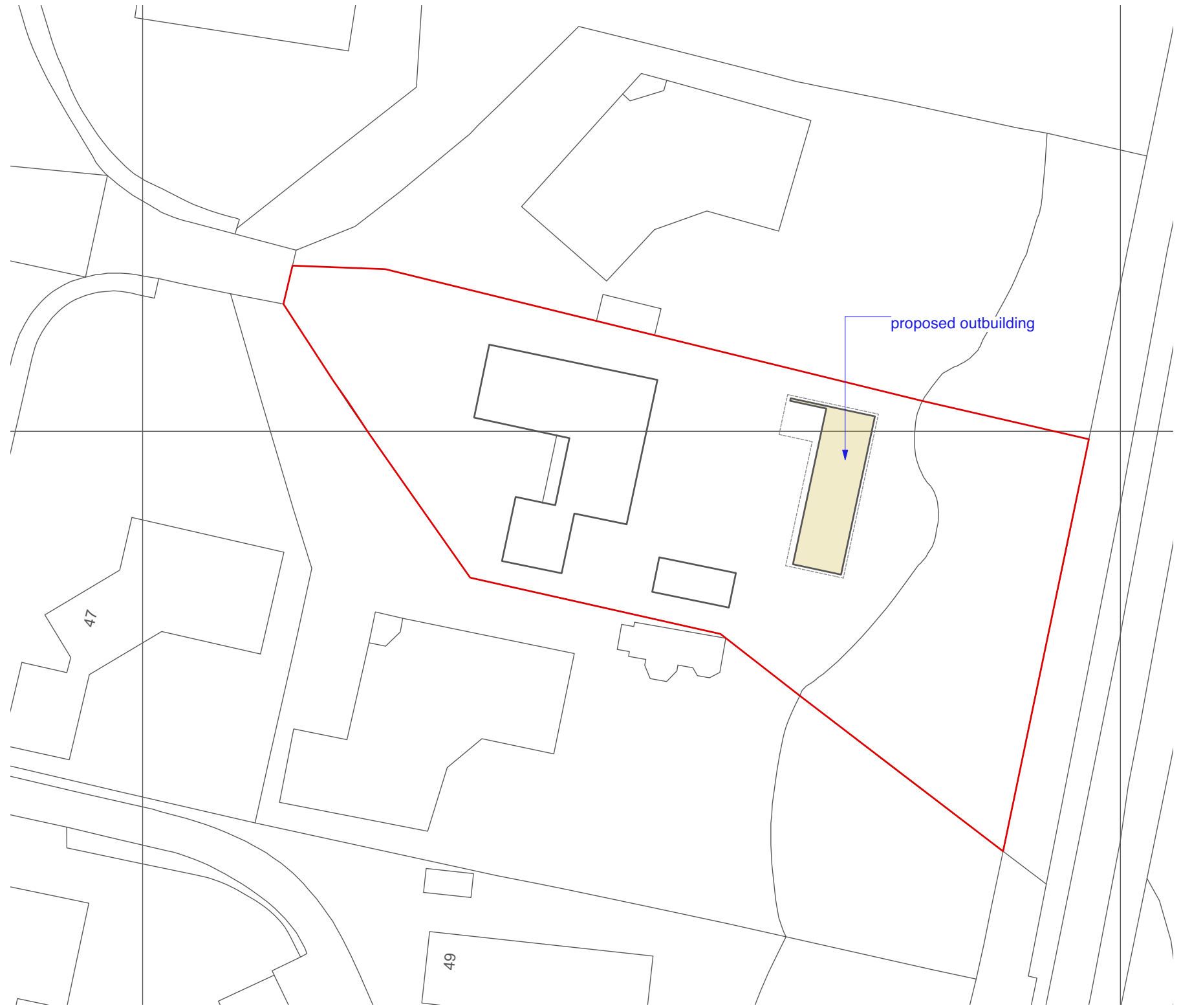
002 | site block plan | 1:500 @ A3