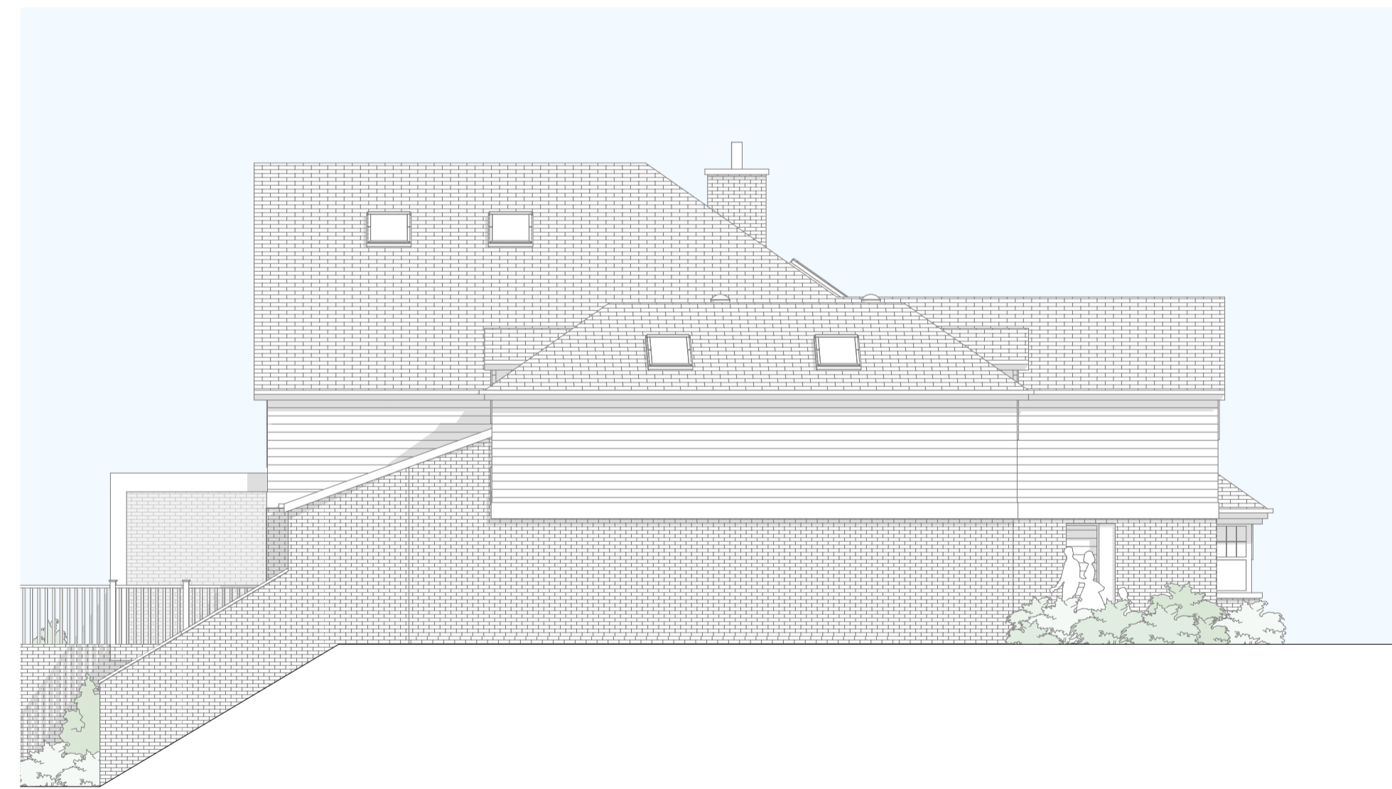
Proposed Side Elevation (East) Scale (A1): 1:100