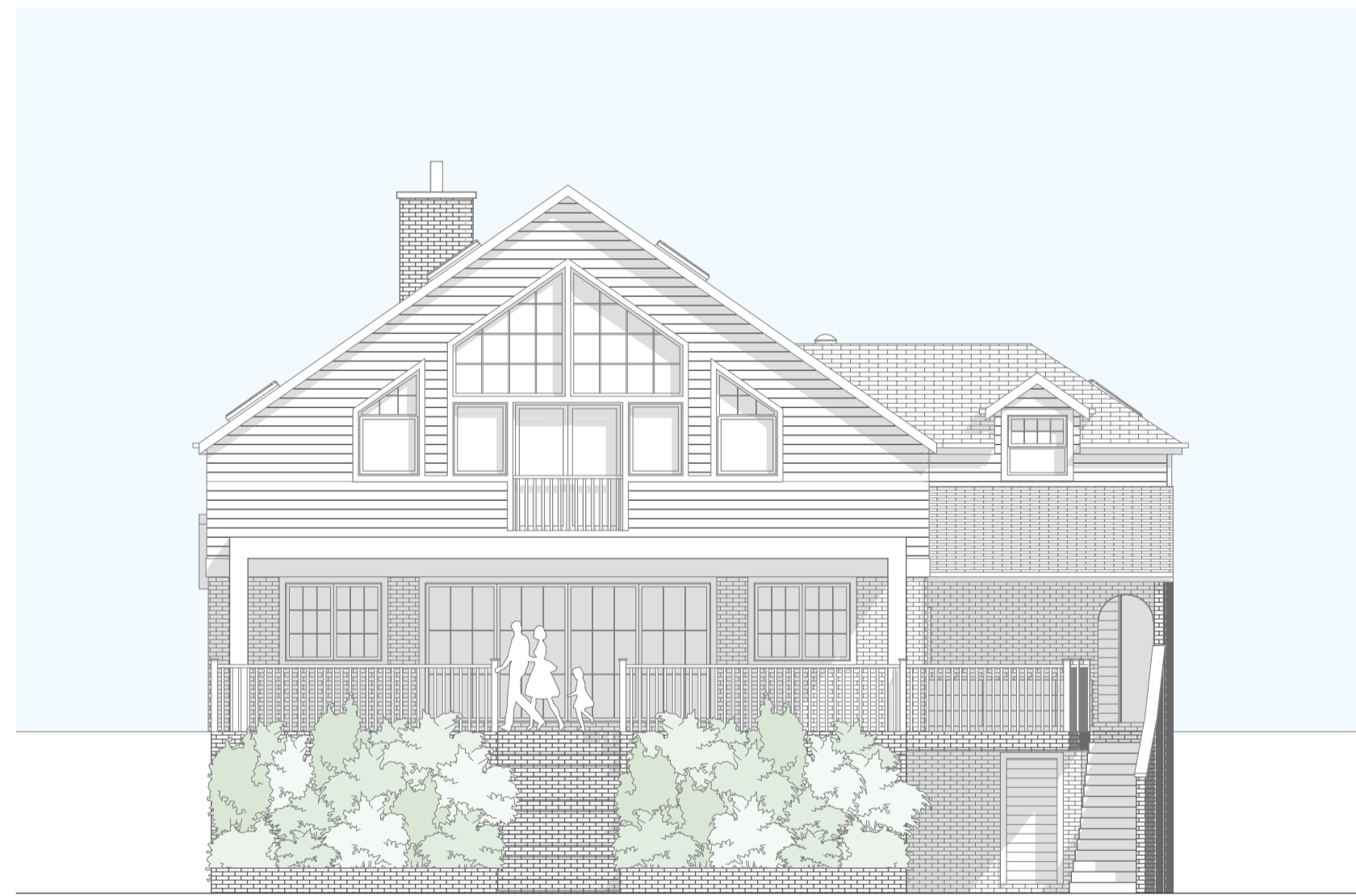
Proposed Rear Elevation Scale (A1): 1:100