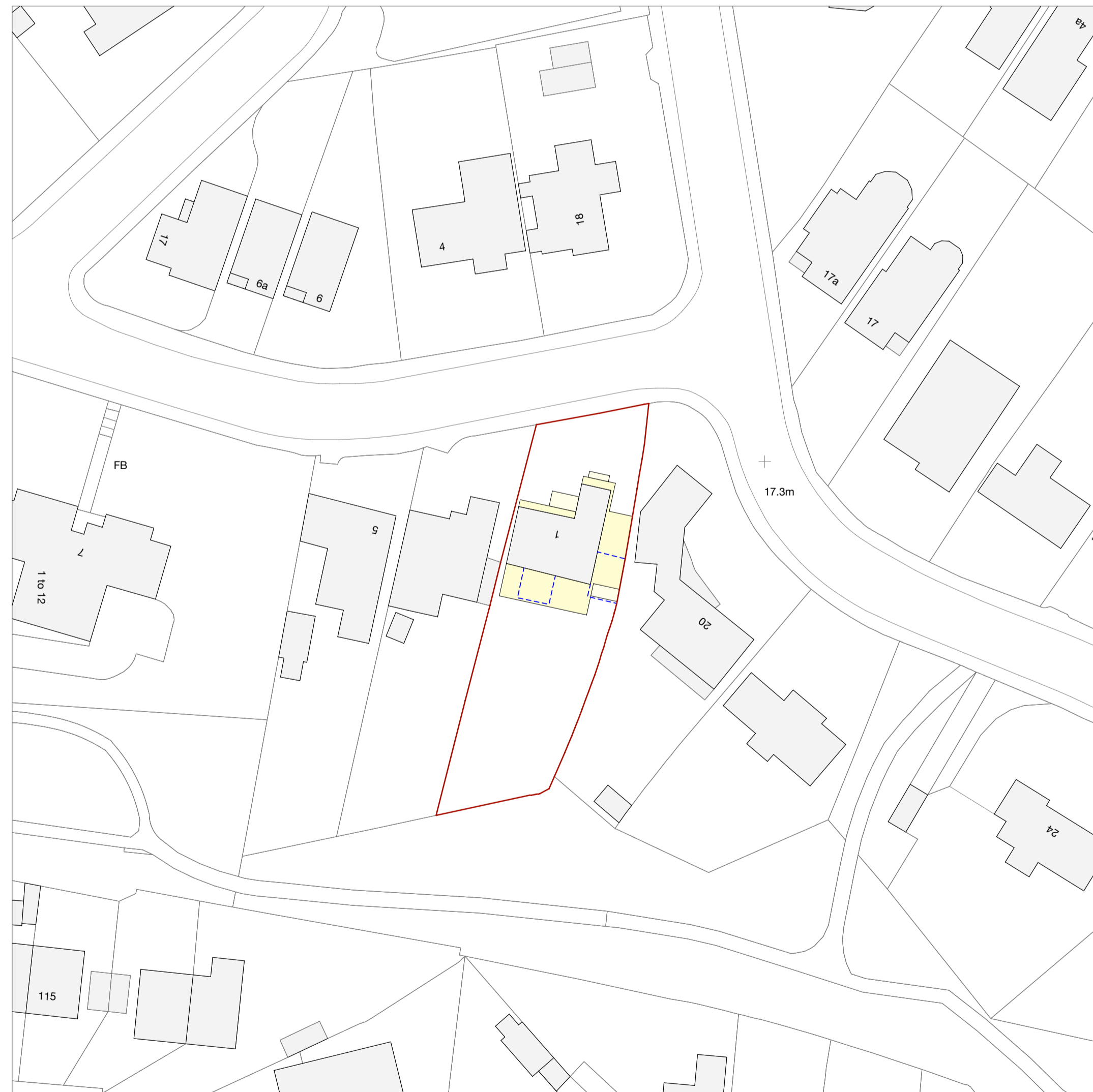
Proposed Block Plan Scale (A1): 1:500