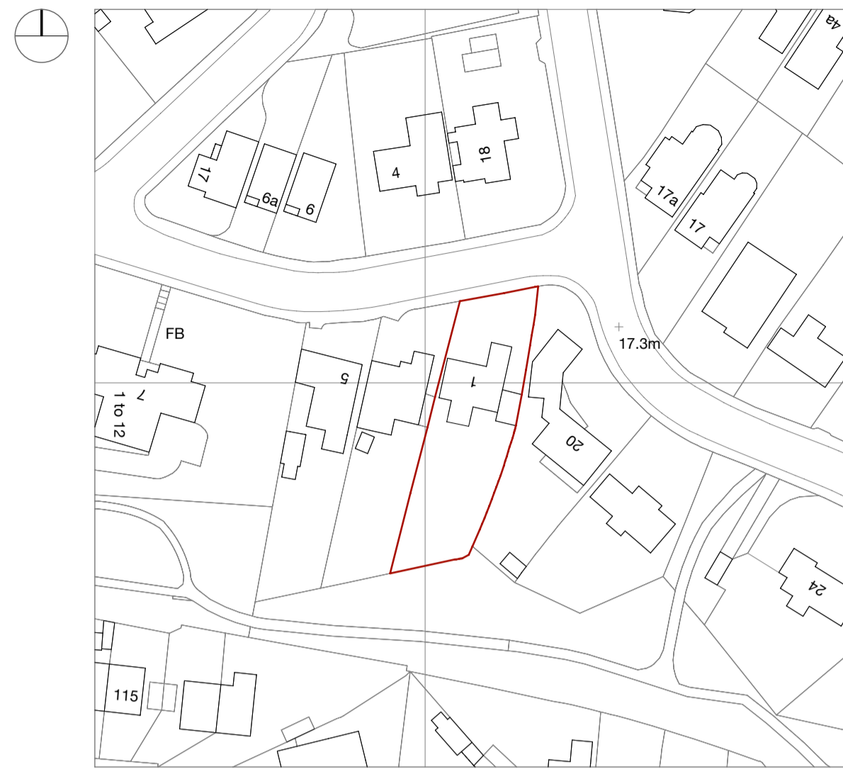
Location Plan Scale (A1): 1:1000