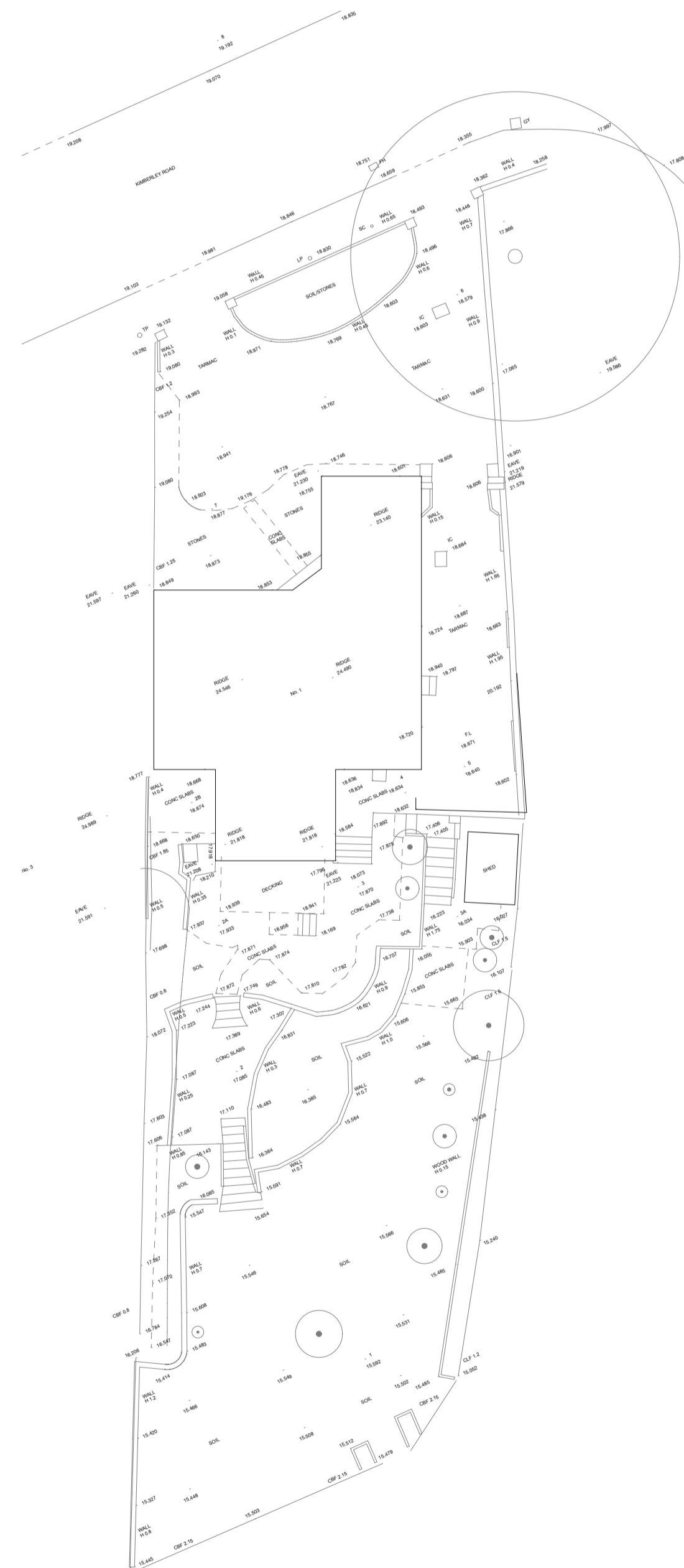
Topographical Survey Scale (A1): 1:200