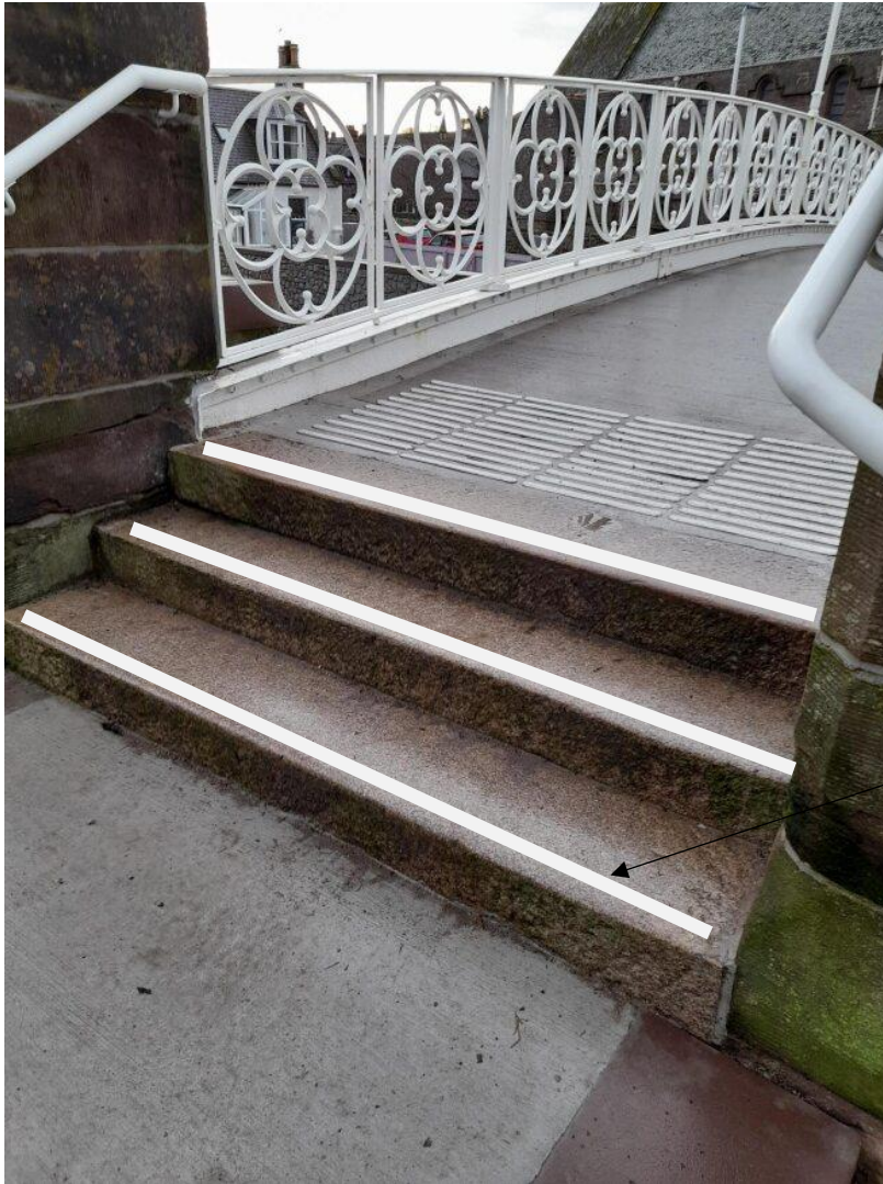
Indicative illustration of white anti slip tape on approach steps