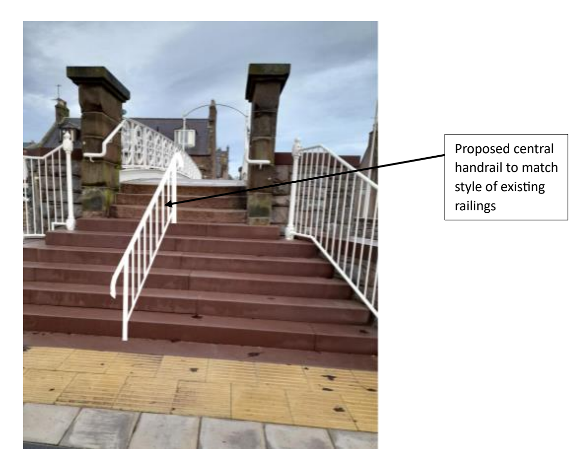
Figure 2: Proposed arrangement