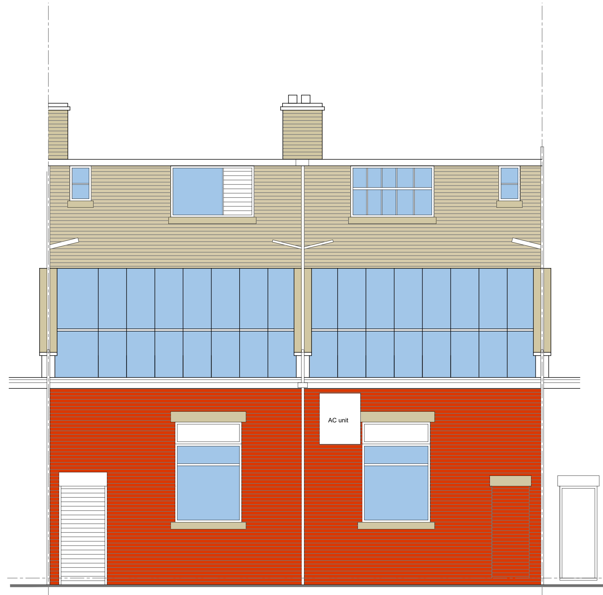
Existing Rear Elevation Scale 1:50