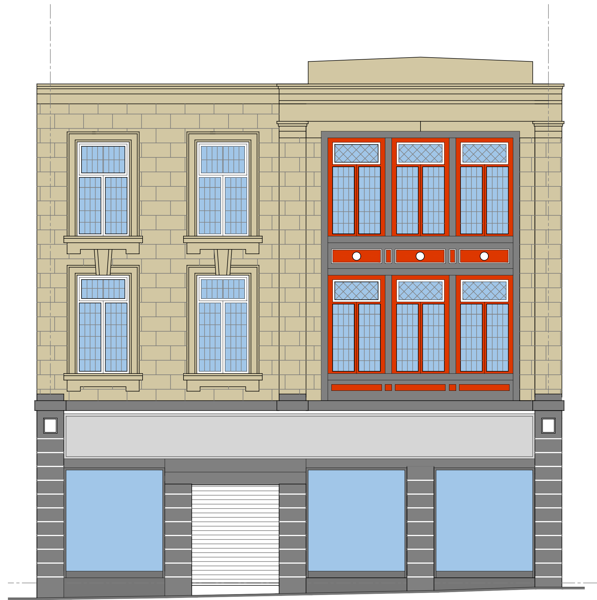
Existing Front Elevation Scale 1:50