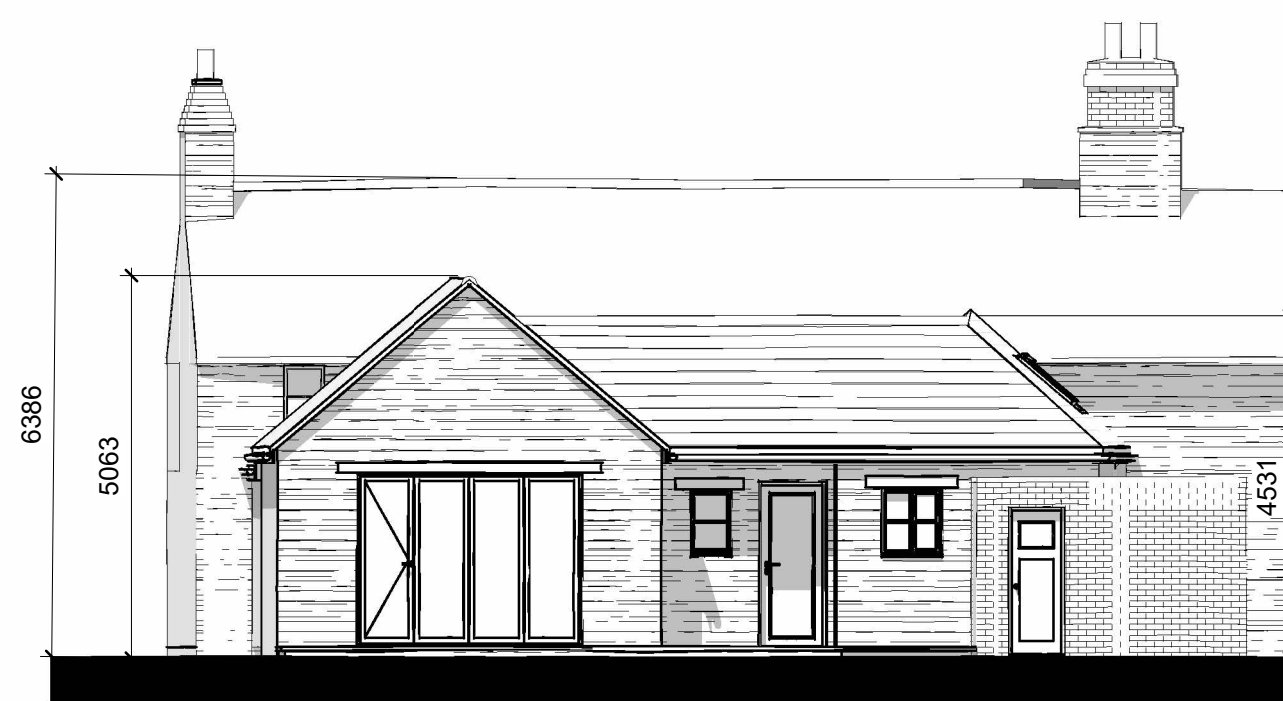
REAR (SOUTH-WEST) ELEVATION 1 : 100